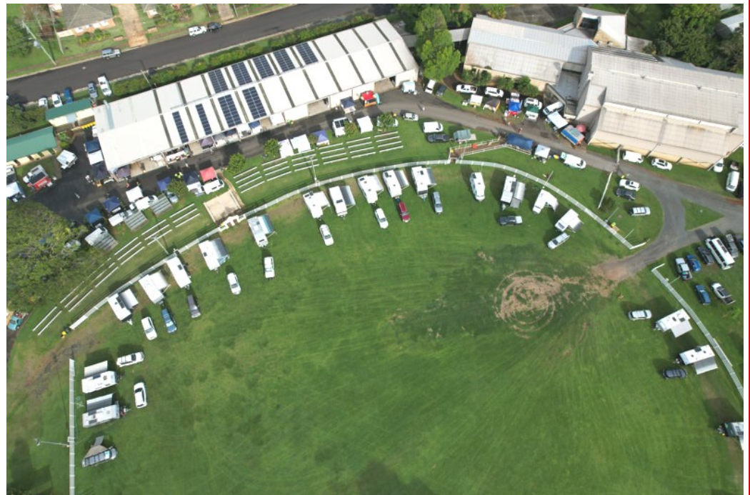
Aerial view of our rally at Alstonville