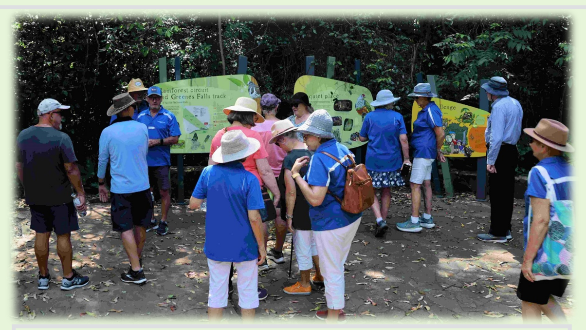
A noisy bunch of walkers checking the information on the 'Quiet Place' sign!!

It was a beautiful morning when eight cars headed off to Mt Glorious. The Goat Track was closed however we enjoyed the sound of bell birds as we drove up Mt Glorious road and parked at the Maiala day use area.