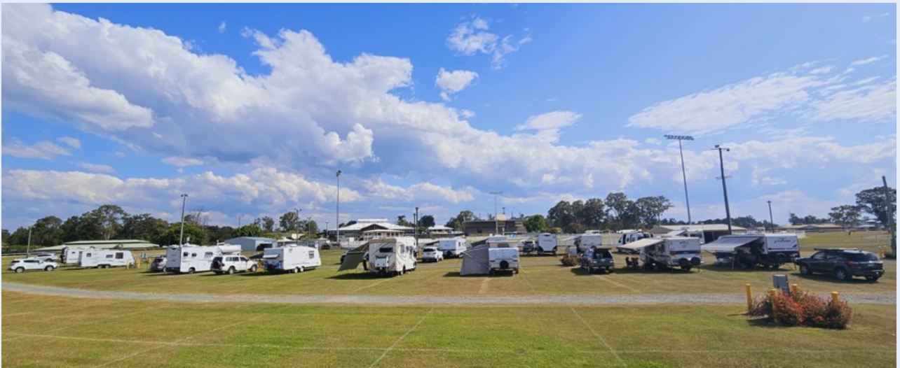
Grass galore underfoot at the Gympie Showgrounds Below: The track gate finally opens for Bruce after a six hour wait to finally bring his van in. A very foggy morning was Sunday.