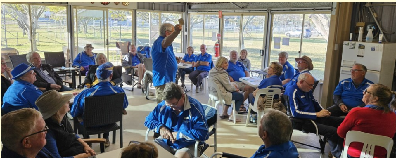
It was a very successful afternoon activity - well done!