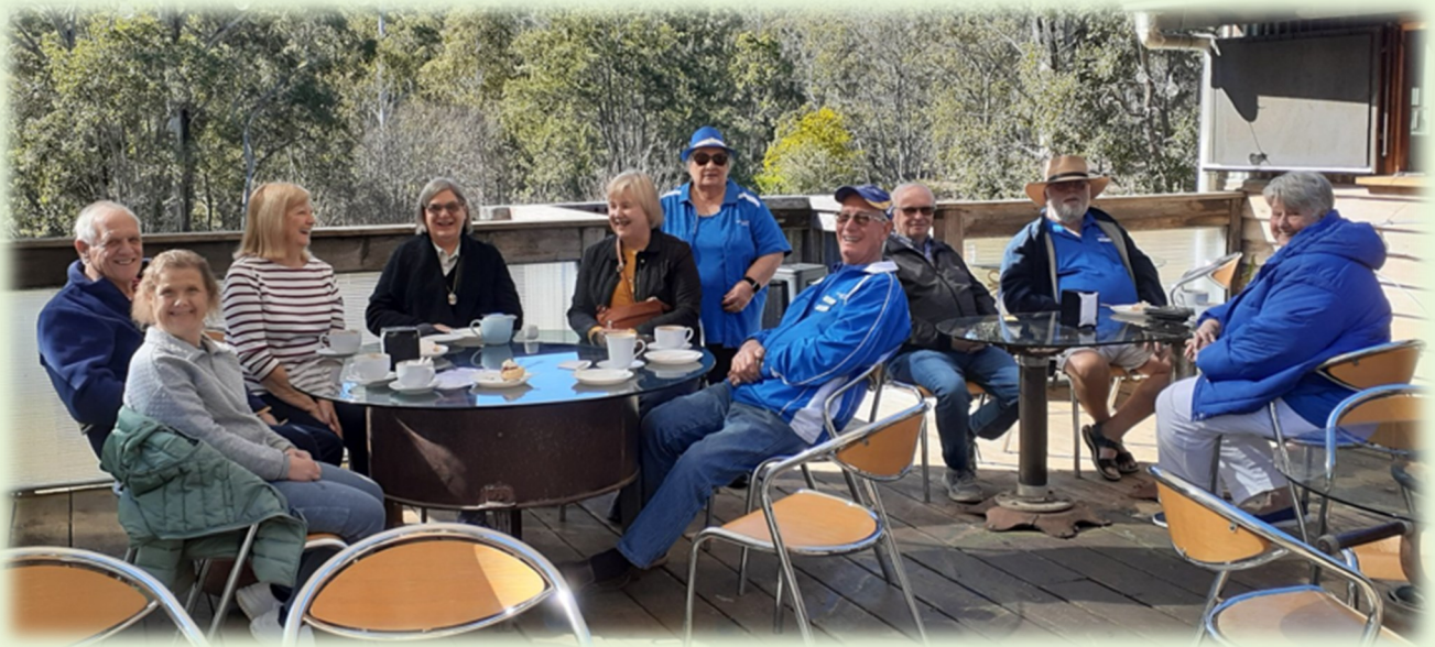
Morning Tea was enjoyed on the patio at the farm