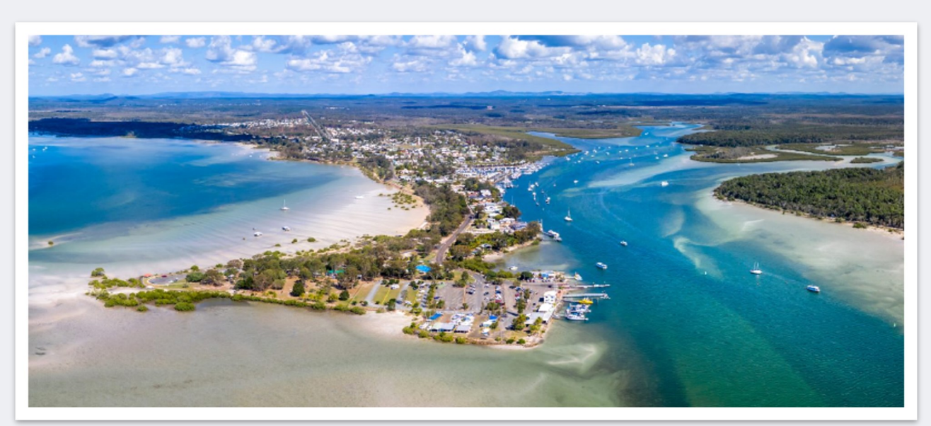
A beautiful reminder of Tin Can Bay