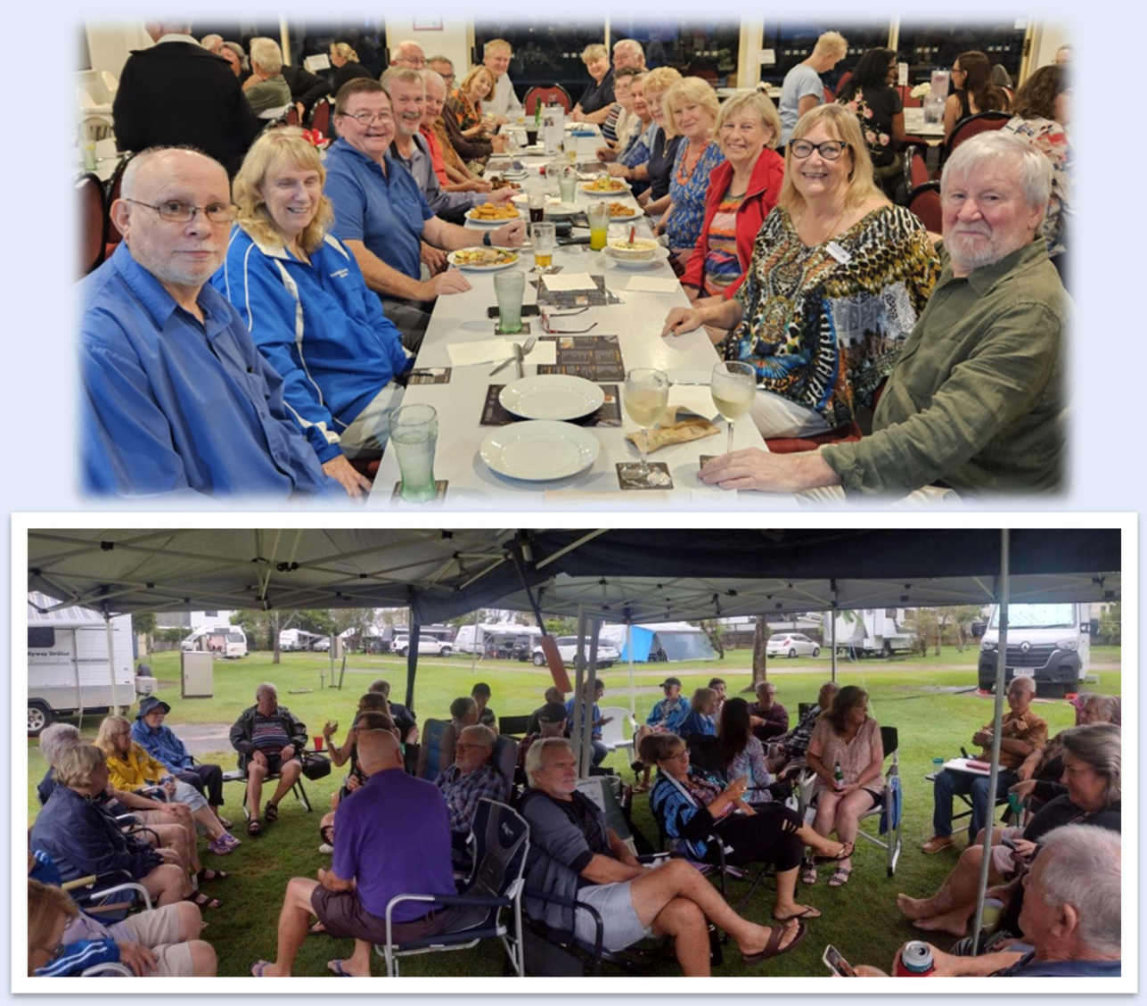
Happy Hour under the gazebos