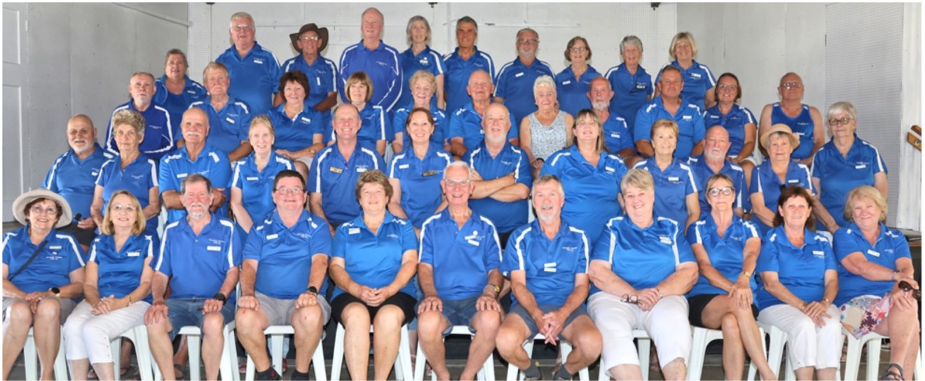
A fantastic rollup of members at our AGM on Saturday