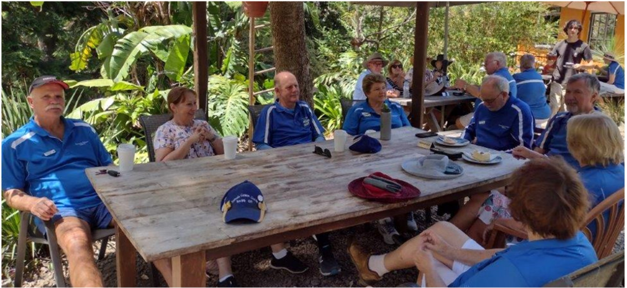
A well earned rest at the 'Café in the Mountains' after the forest trek around Mt Nebo