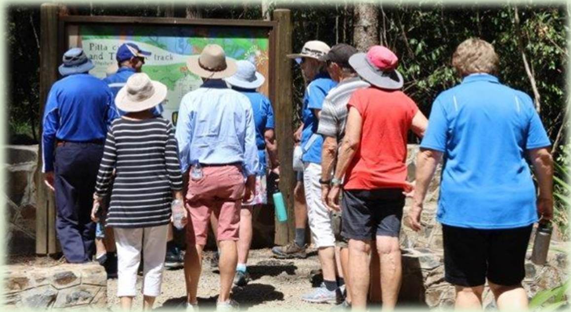
Which way do we go? Checking the map for Pitta Crossing

The Magical Mystery Tour on Saturday turned out, well, magical! We had six cars head off taking the Goat Track (one way gravel road up the hill, with some nice views along the way) towards Mt Nebo.