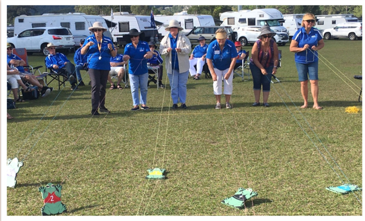
The sun was shining like a summer's day and the ladies on the field were showing their style