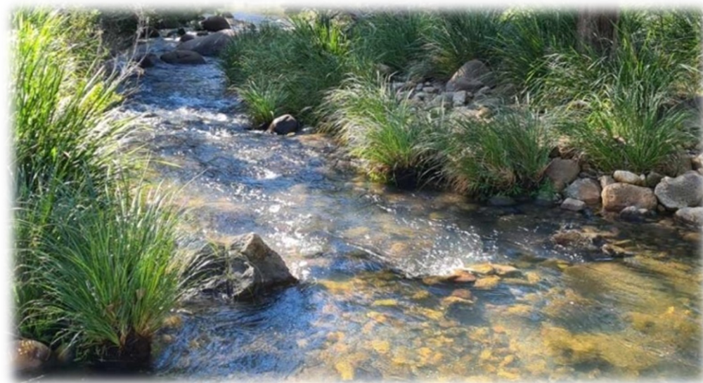
One of many clear running streams of the Logan River. This one under the causeway near Mt Barney

Only the officially sanctioned shirt is acceptable. Rules 7 and 8 also apply.