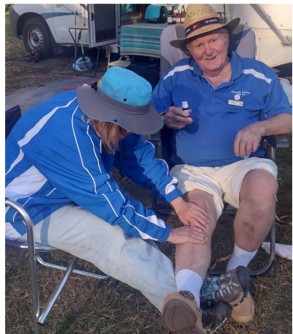
A little accident before the afternoon activity began. (Just had to step over the string Rod) Guess the fall was worth the excellent nursing care afterwards