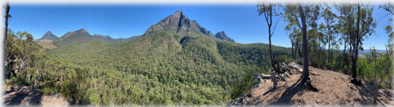
Our walker's view from Yellow Pinch Lookout towards Mt Barney