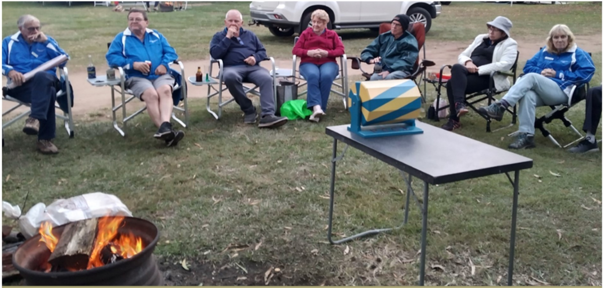
Just chillin' before the awards and raffle