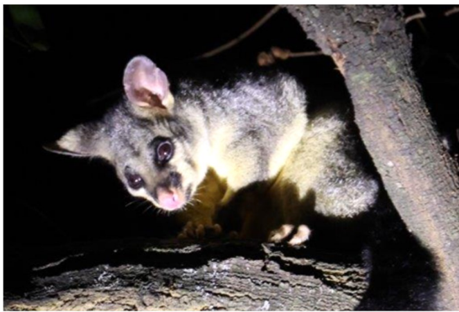
This little 'visitor' knew where his next feed was coming from