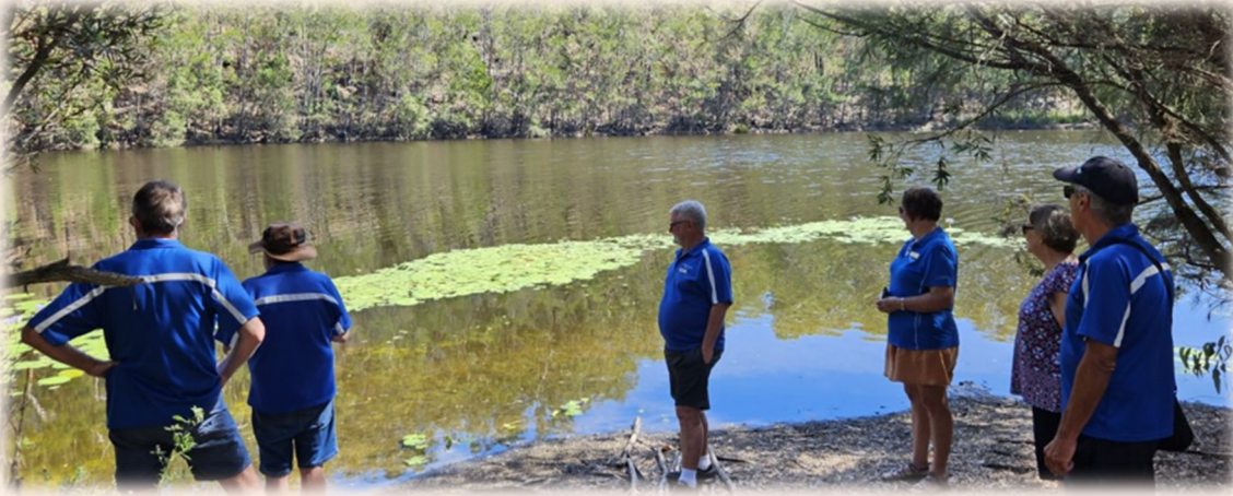
Some of our members enjoyed a drive along Blacksnake Road, south of Kilkivan visiting our beautiful bushland and a café stop