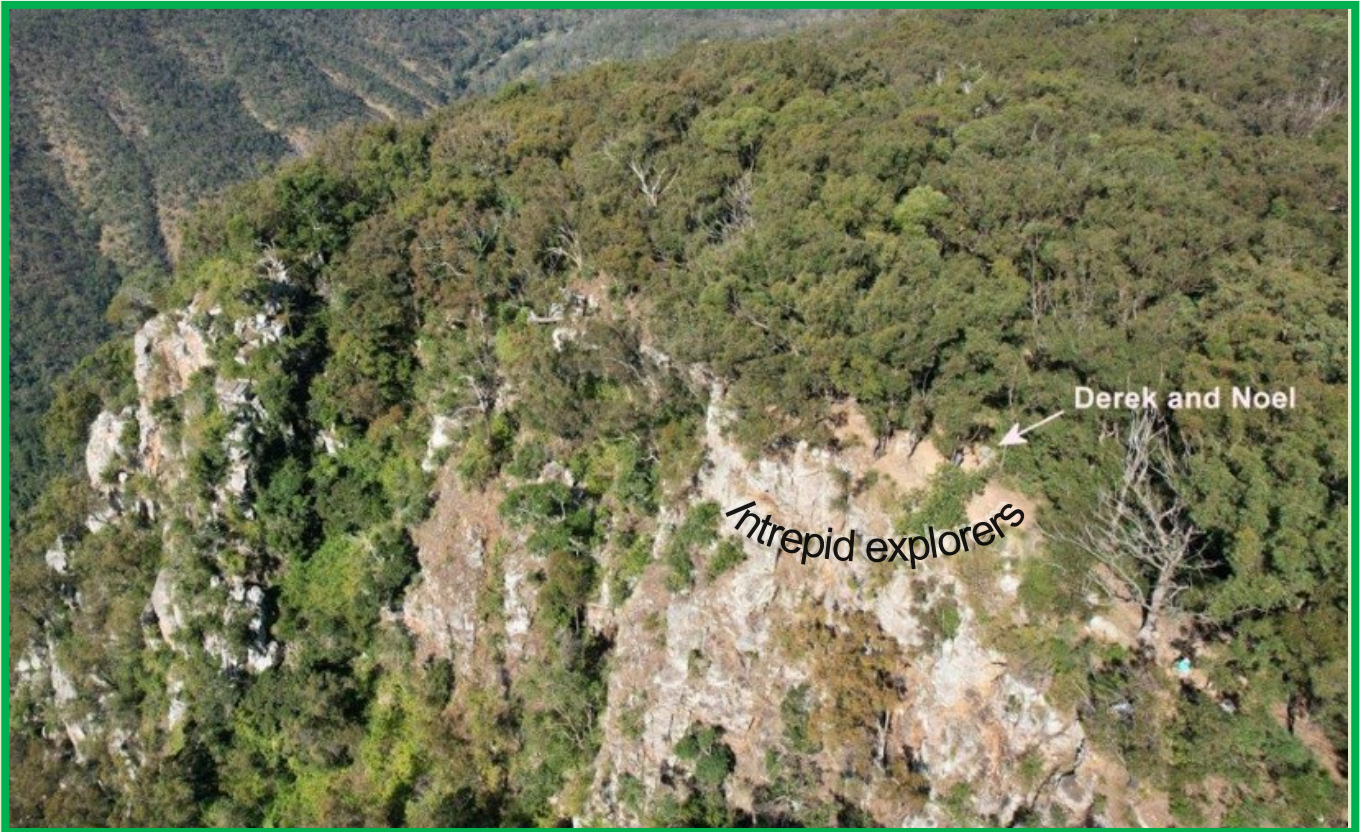
Derek, Noel and Les took on quite a trek in the surrounding ranges