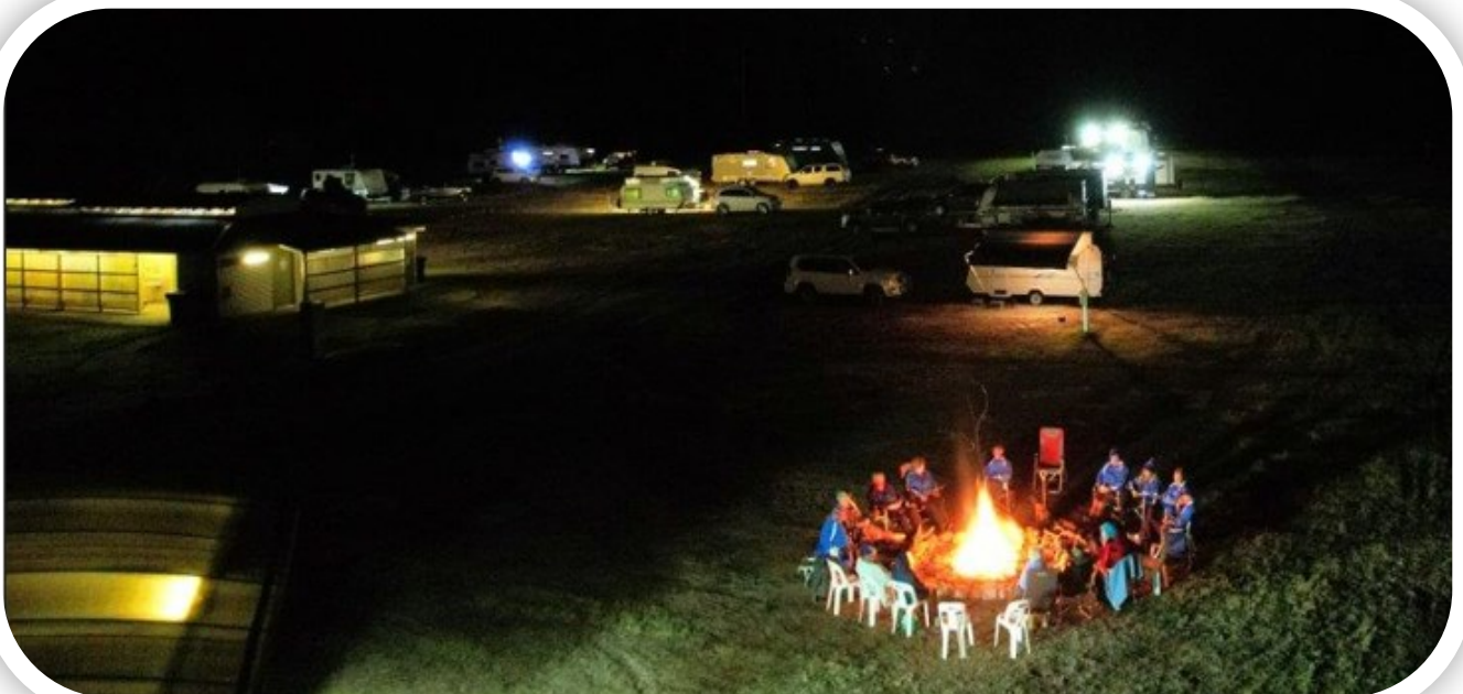
Just two of the spectacular drone photos taken by our illustrious photographer, Les Always amazed by these scenes taken from a very different perspective