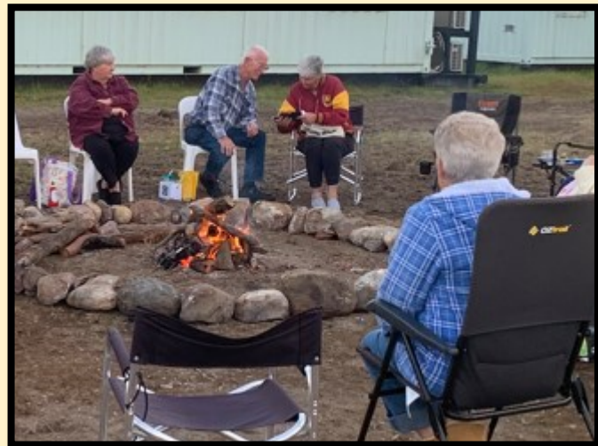
Now ready for the serious business