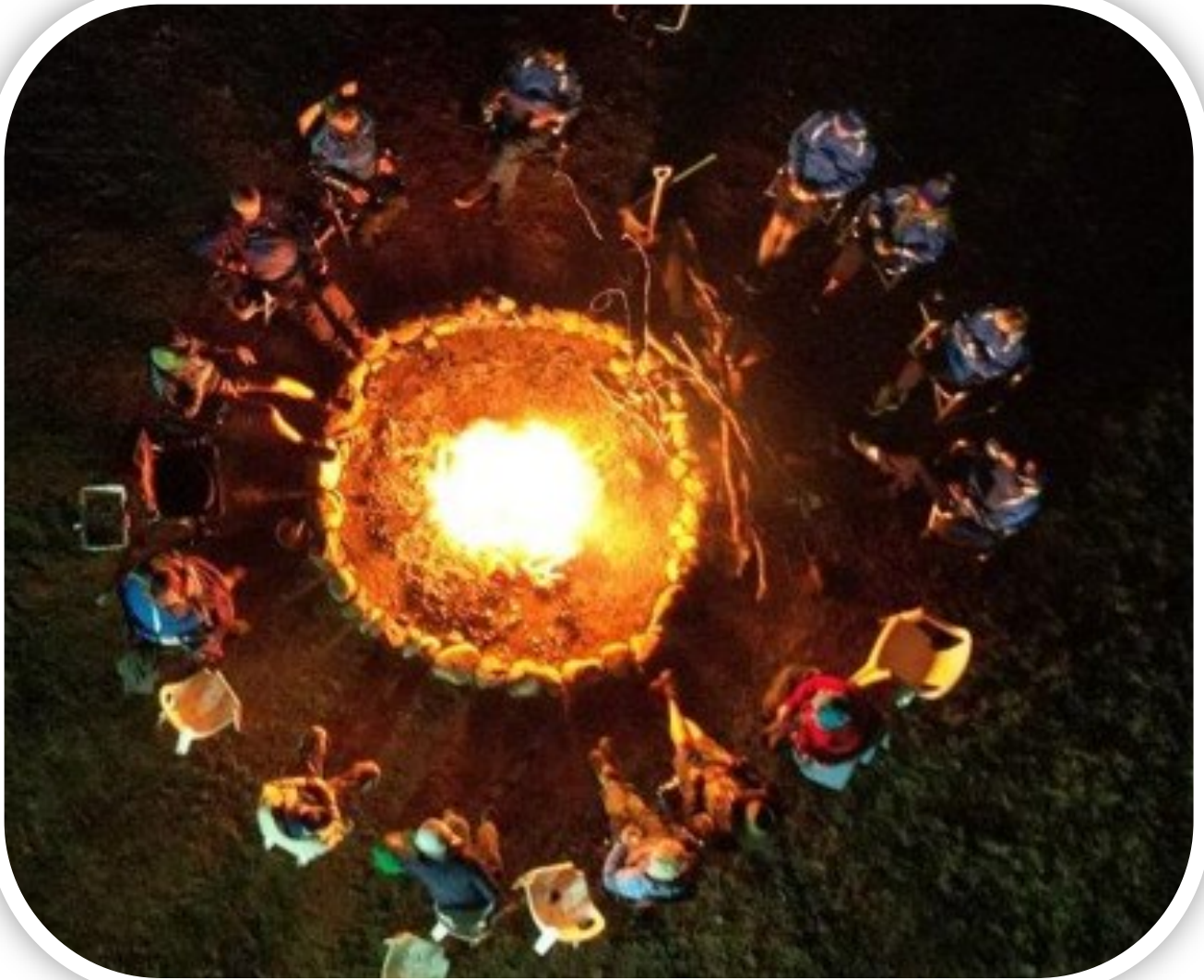
In the shadow of Ivory's Rock, we were warmed by friendship and good cheer