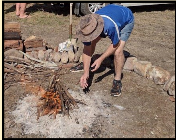
From little things big things grow....