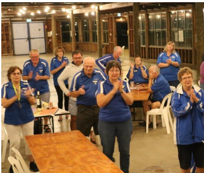
What song was that?