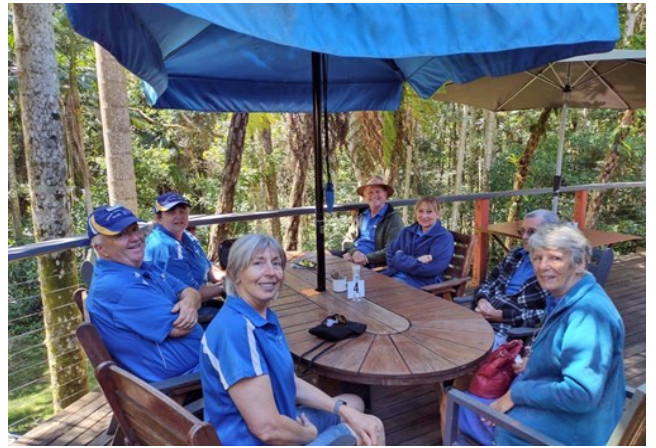
Morning Tea at Elm Haus Cafe