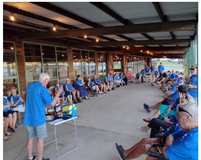
Happy Hour and Raffle Draw