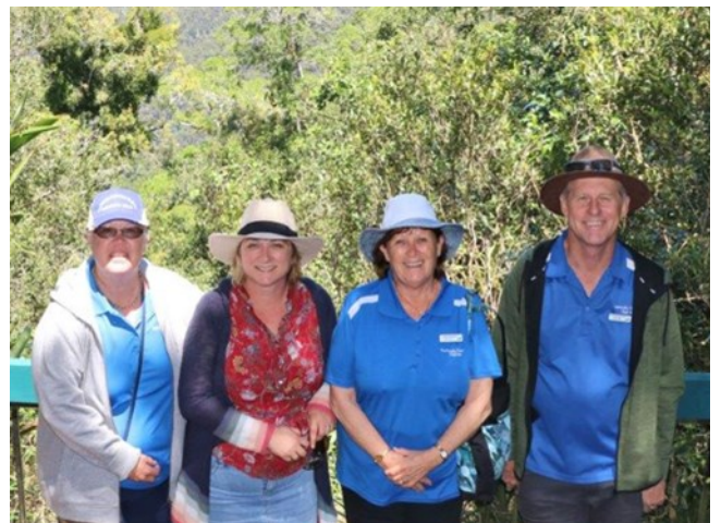
At the end of the track