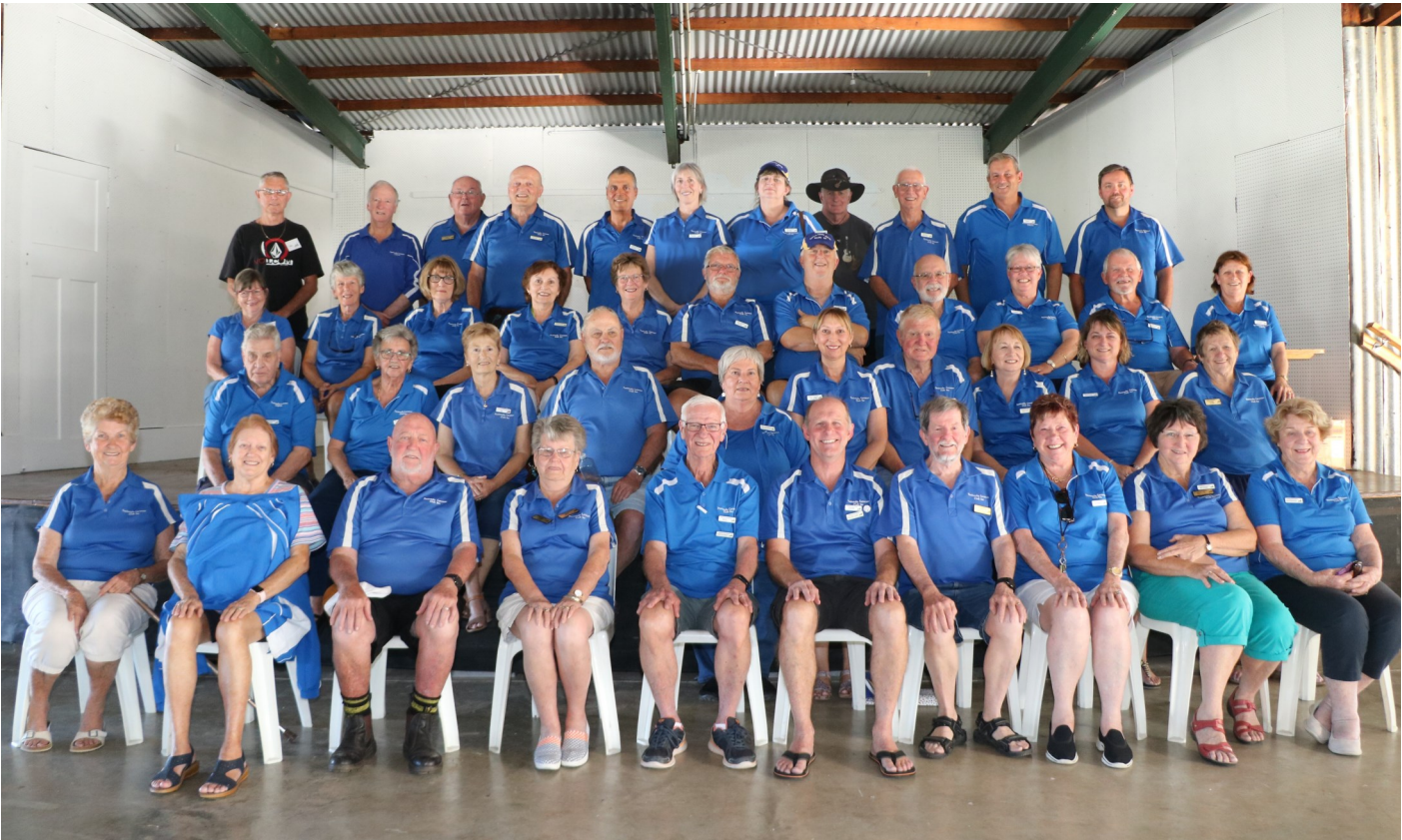
October 2021 Club Members