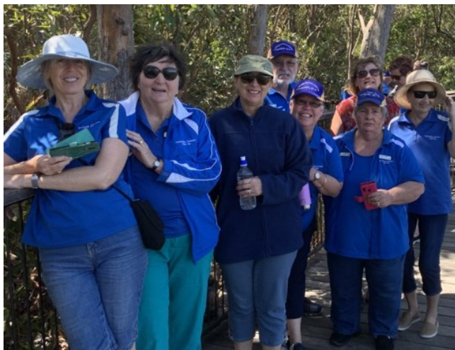
The 'goat track' group