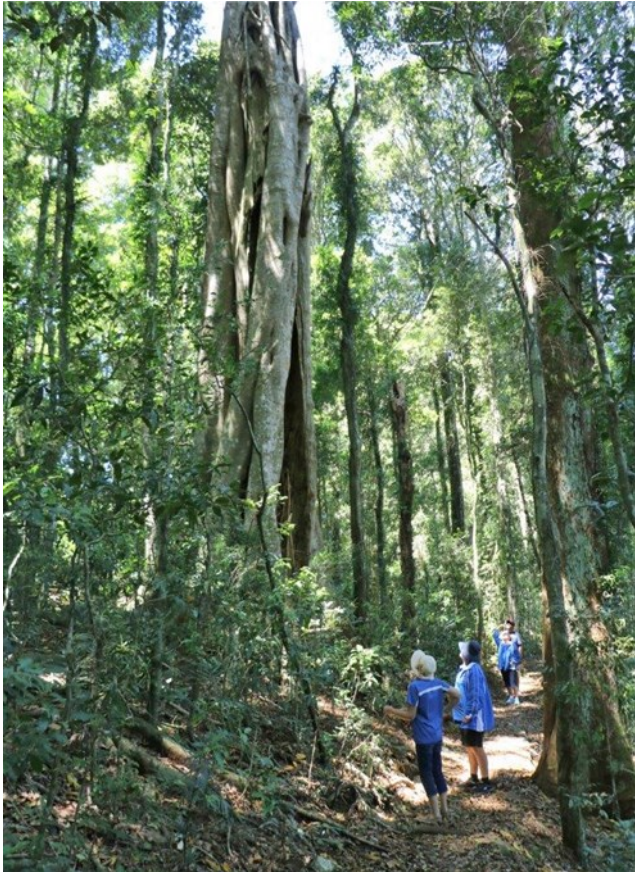
View of the strangler fig tree