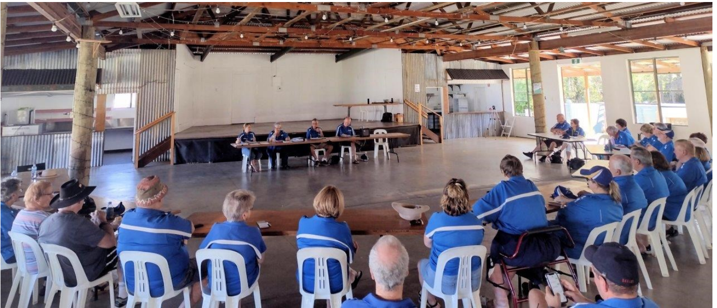
An excellent turnout for our Saturday afternoon AGM