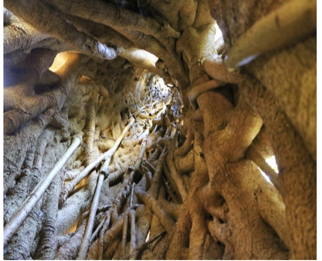
Looking up the hollow core inside the strangler fig tree