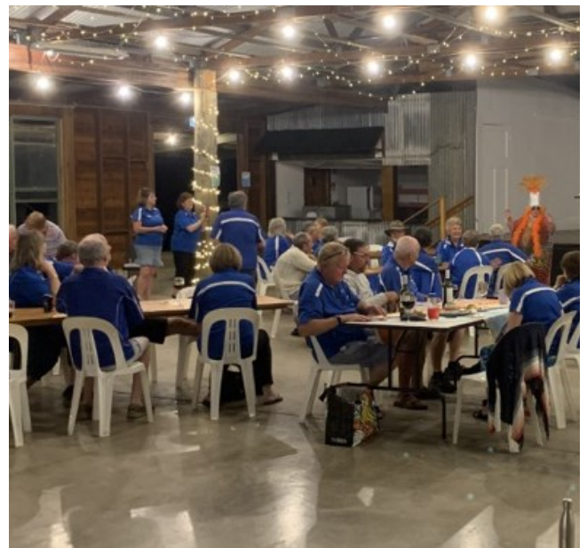
Heads down for Bingo