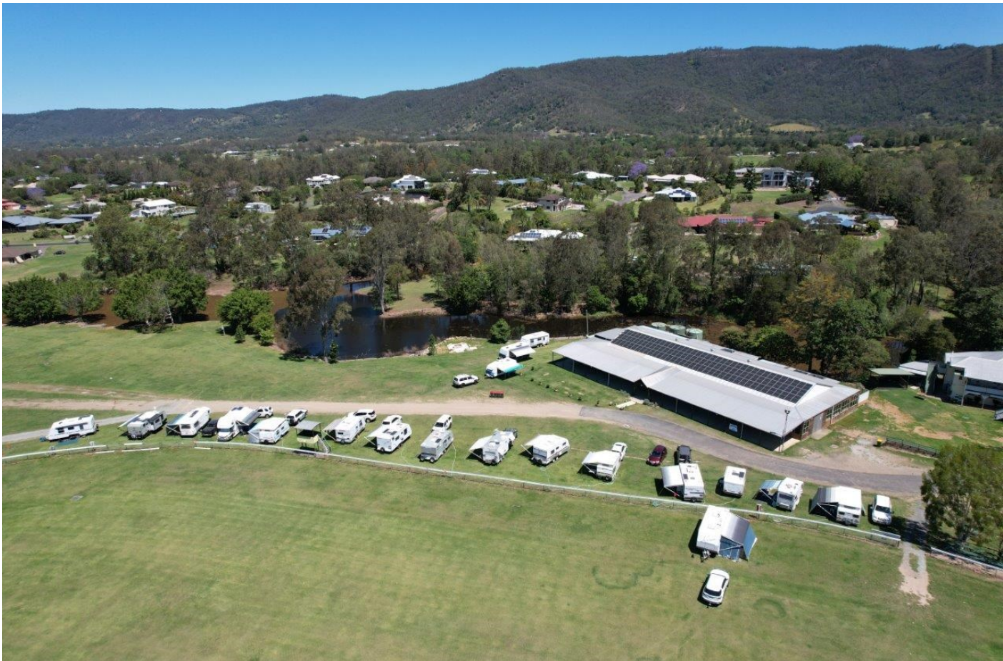
Aerial view of Samford Showground rally site and Recreation Hall