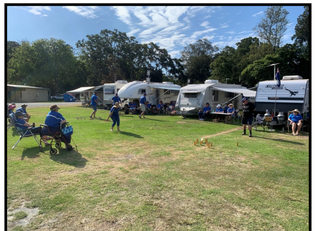
Saturday Klop Activity