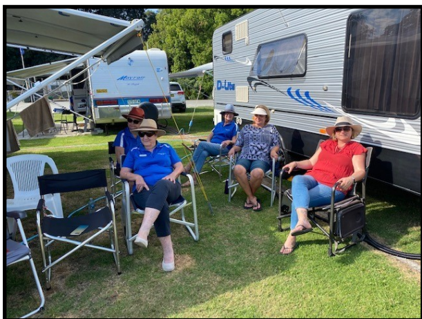
Ladies in waiting