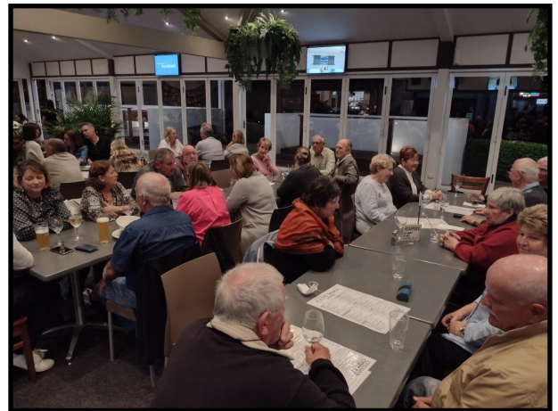
Friday night at the Canungra Hotel