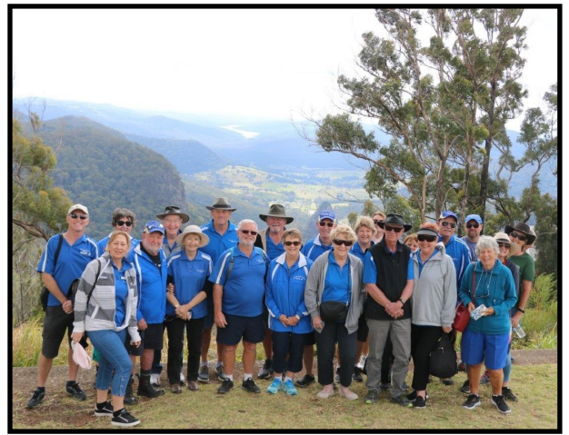
Site of the old Binna Burra Lodge