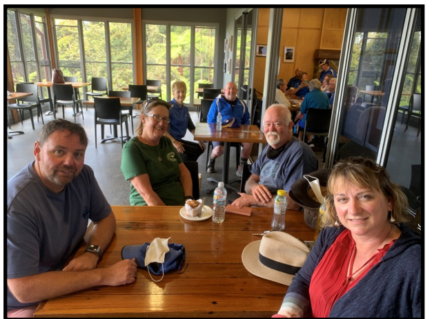
Saturday morning tea at the Binna Burra Tea