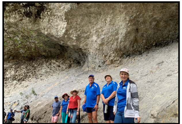
Binna Burra Walk