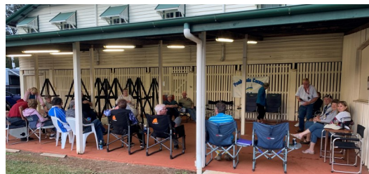
Friday afternoon drinks