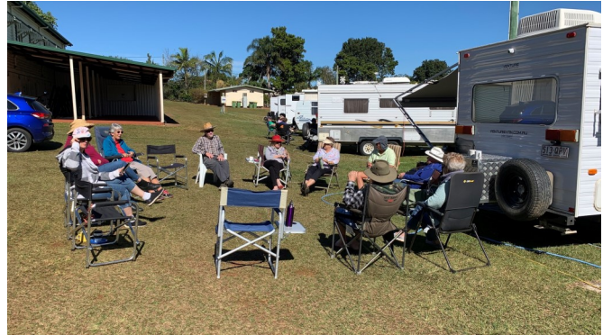
Sunday morning tea