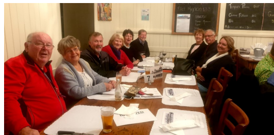
Friday night at the Pomona Hotel