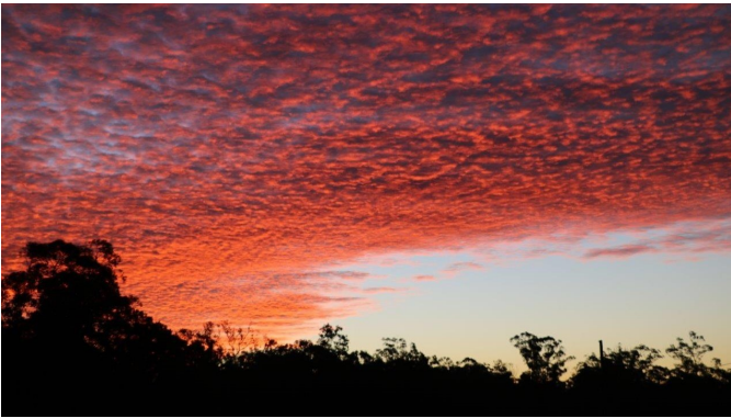
Lovely Saturday night sunset