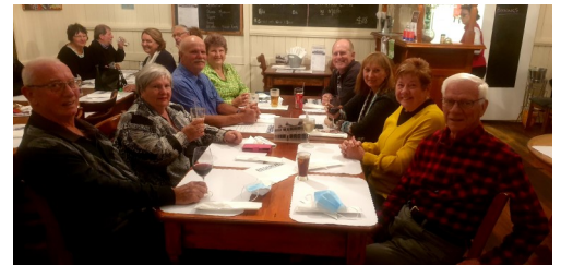
Friday night at the Pomona Hotel