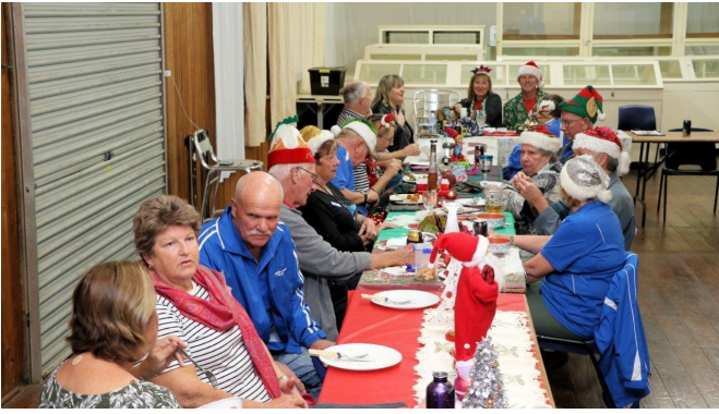
Xmas in July BYO dinner