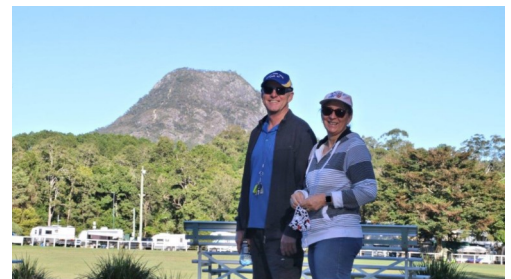
The few Saturday morning walkers