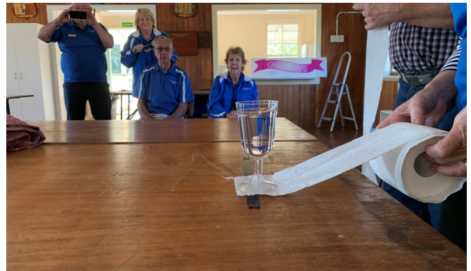
Another photo finish