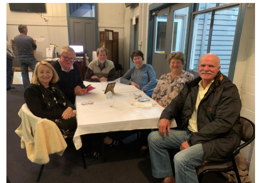
Friday night at the Marburg Hotel