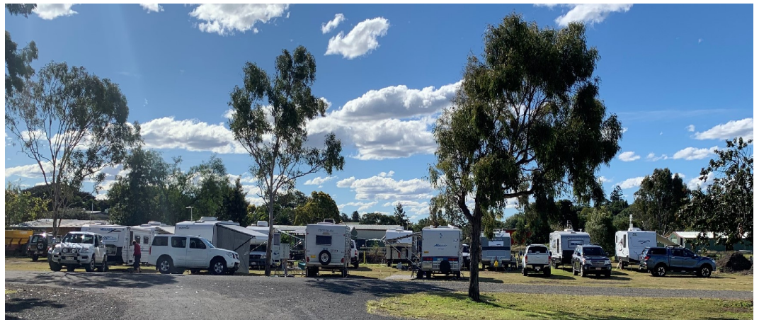
Marburg Caravan gathering