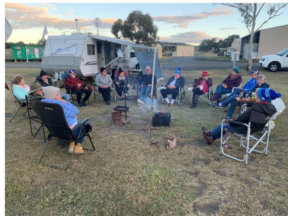
Sunday afternoon gathering around the fire pits