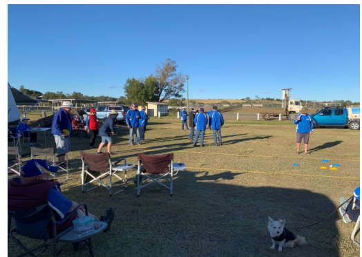
Saturday afternoon Disk Bowls activity