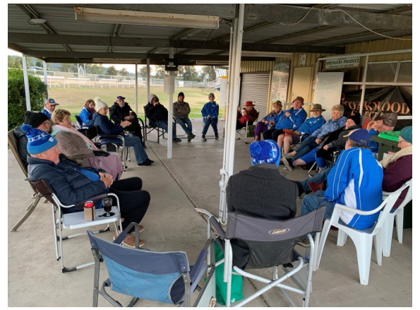
Saturday afternoon gathering out of the breeze