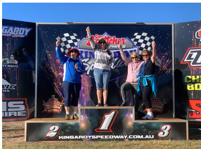
Lady walkers celebrating