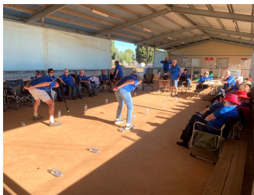
Swing your balls activity