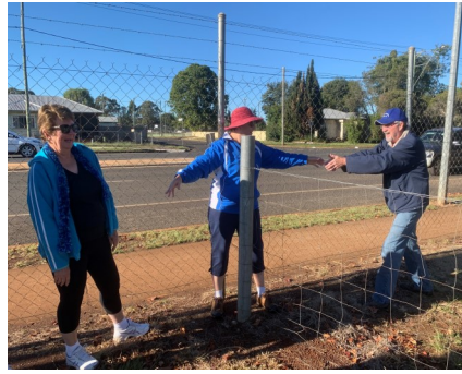
Maybe not a good shortcut