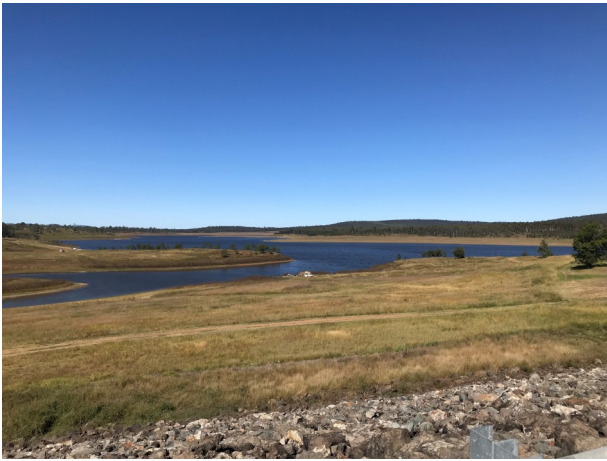
Bjelke Petersen Dam