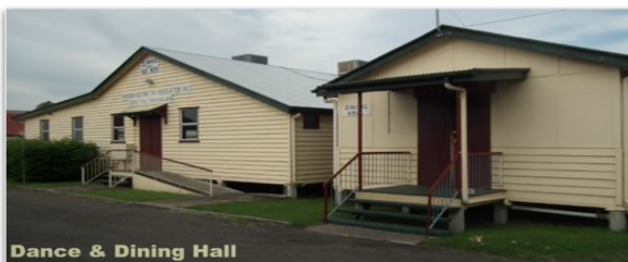
Dance & Dining Hall

Next Month's Rally - Marburg Showgrounds Wednesday 16th June - Tuesday 23rd June Queen Street, Marburg QLD 4346 Ph. 0458003262