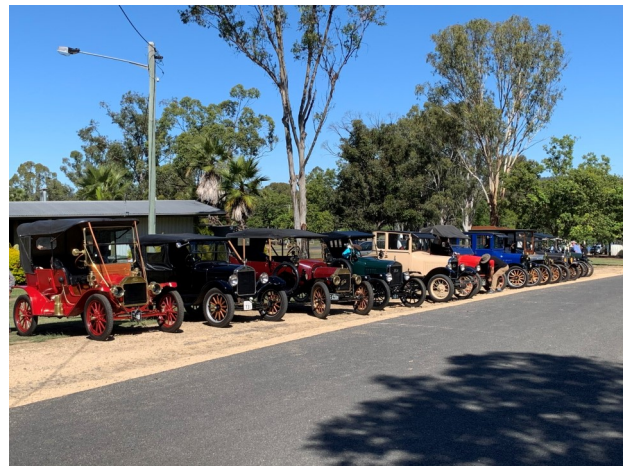
Vintage car club