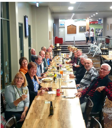
Friday night at the RSL