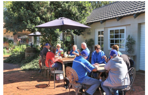
Members enjoying the Lavender Scones