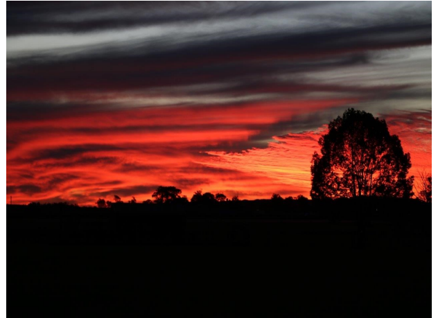
Sunsets on our Kingaroy Rally