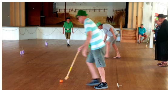
High speed Croquet activity