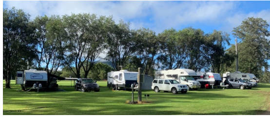
Sunny Friday morning