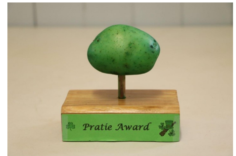
Croquet winners trophy