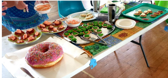
Saturday Irish morning tea