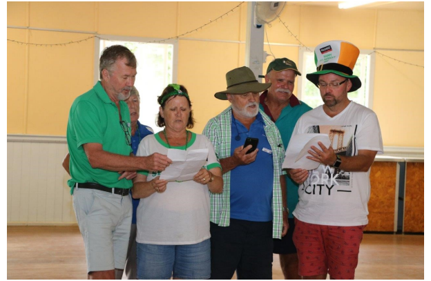
Team Irish songs charades sing along