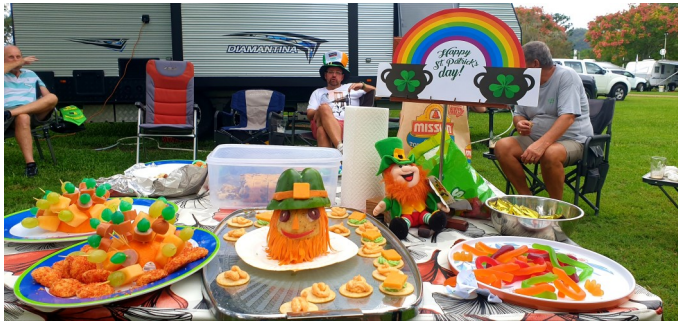
Saturday's Irish afternoon tea