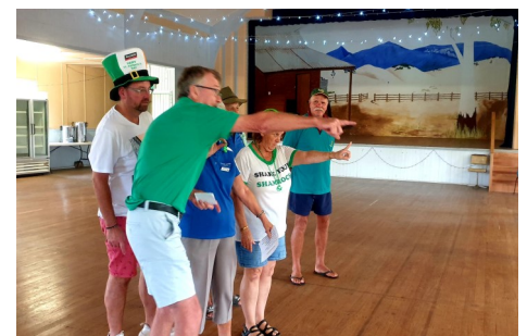
Team Irish songs charades