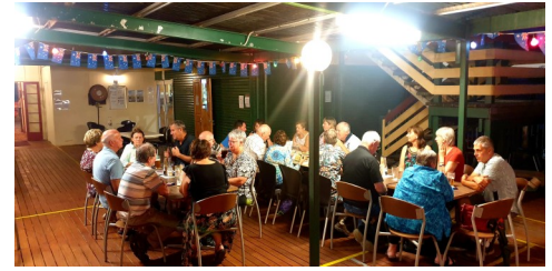
Friday night dinner at the Kenilworth Hotel