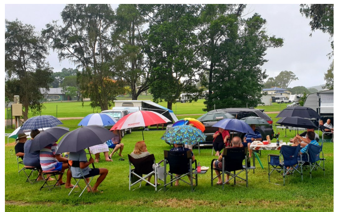
The umbrellas circled for Sunday drinks