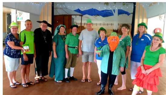
Team Kilkenny the eventual Croquet winners