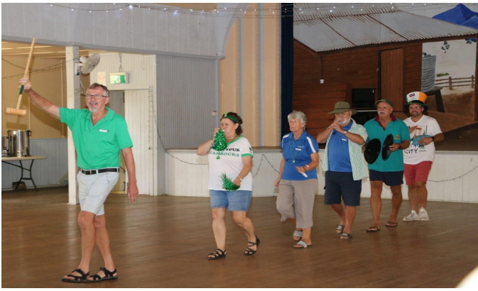
Team charades & the band played on