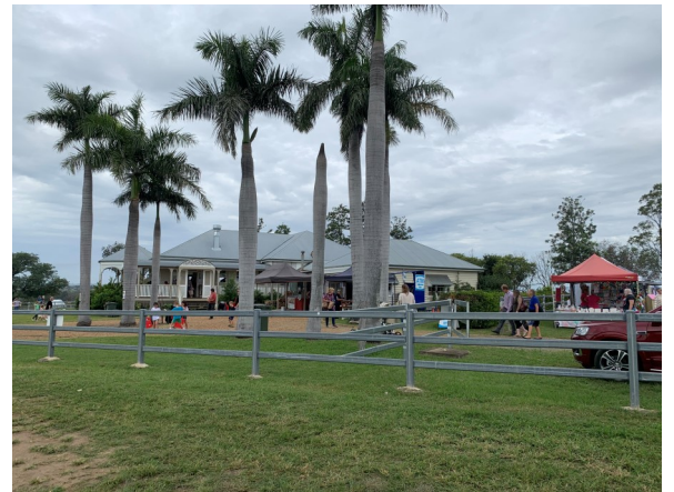
Summer Land Camel Farm