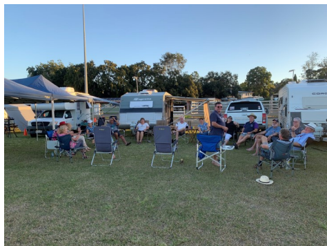
Thursday afternoon drinks