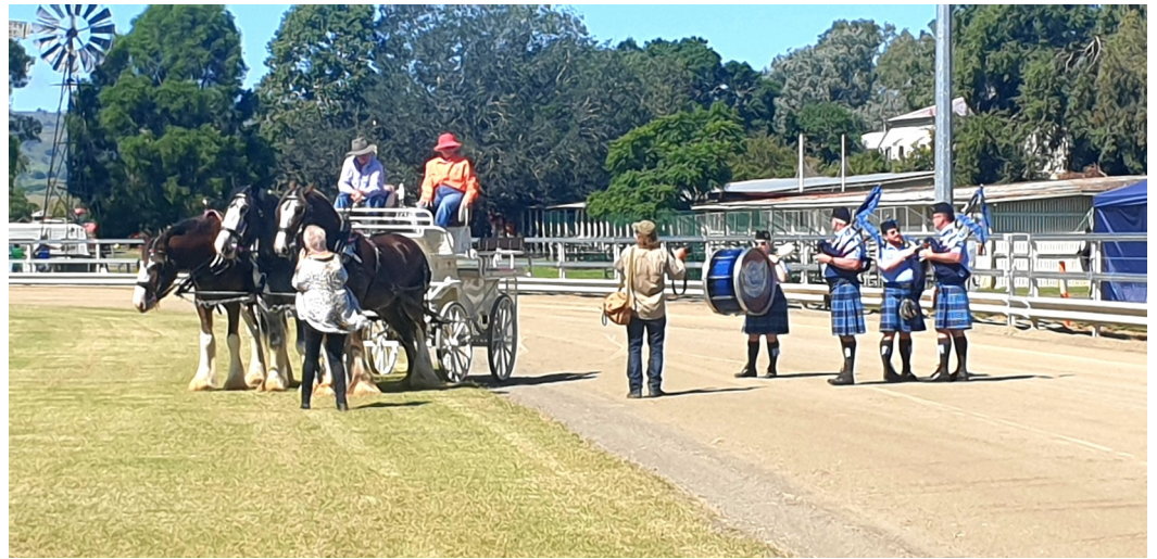
Thursday's welcome to Boonah