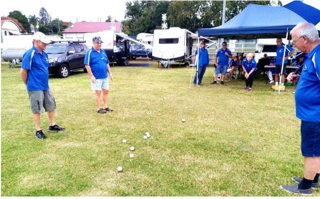
PCCI Bocce comp is underway