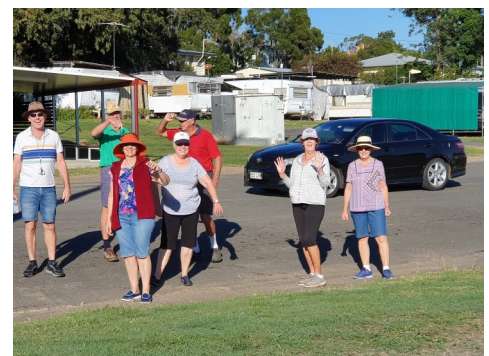
Friday morning walking group