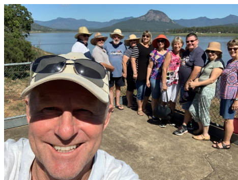
Group selfie on the dam