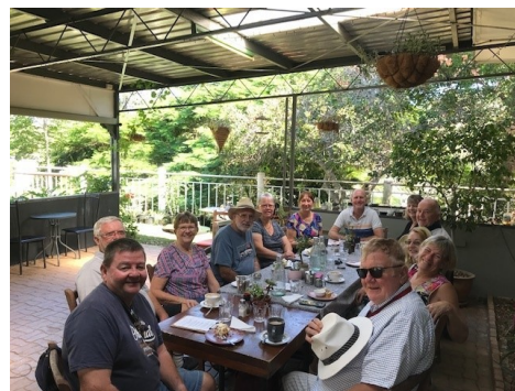
Morning tea at Moogerah Dam