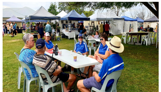
Members taking in the atmosphere