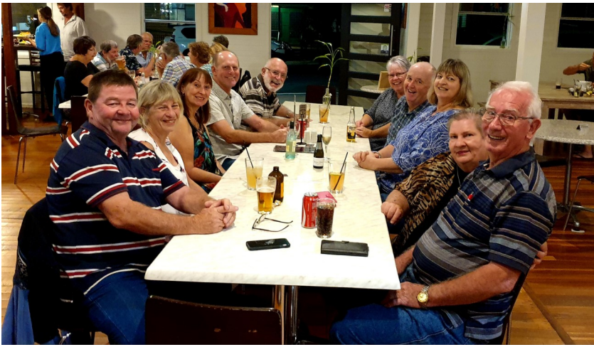
Friday night at the Commercial Hotel