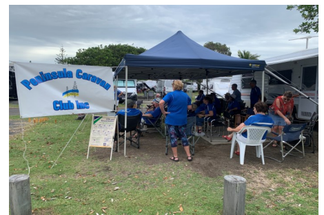
Saturday's Klop activity gathering