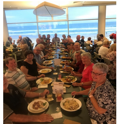
Dinner at the Maroochy Surf Club