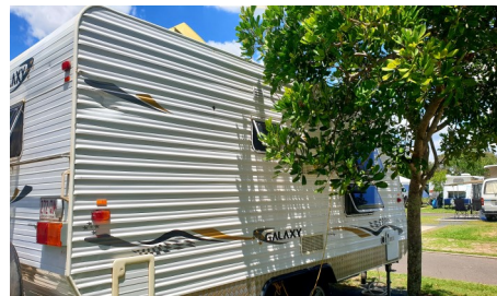
Noel makes friends with nature