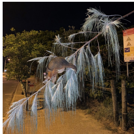
Maroochy local also out to dinner