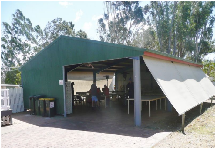
Happy hour shed