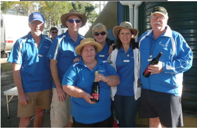
The Champions and the organisers