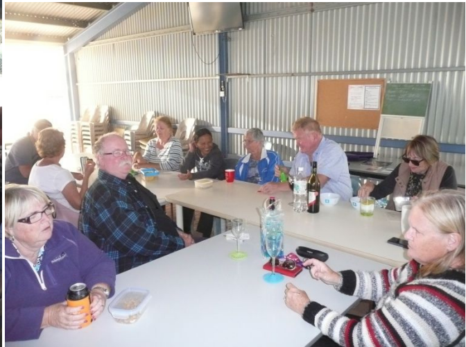
Friday's Happy Hour