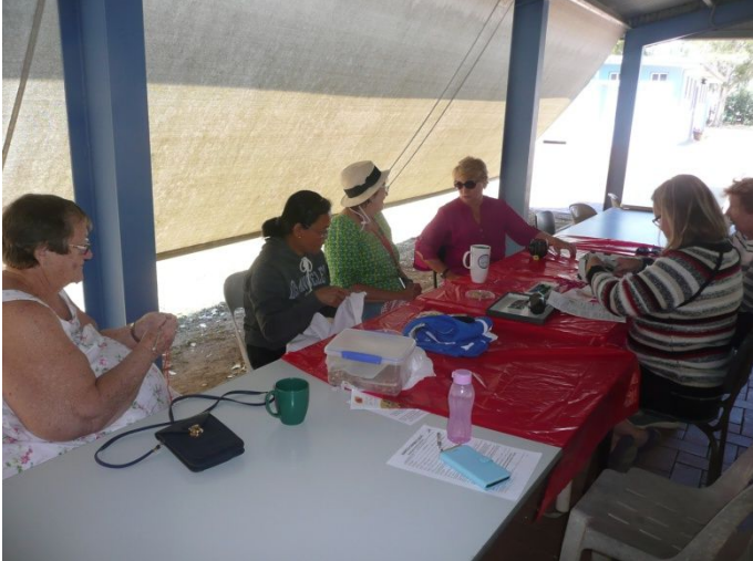
Friday's Craft Club