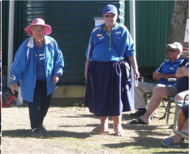
The Anniversaries (Note the snake on the ceiling) and Rod moved