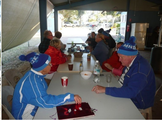
Thursday's Happy Hour