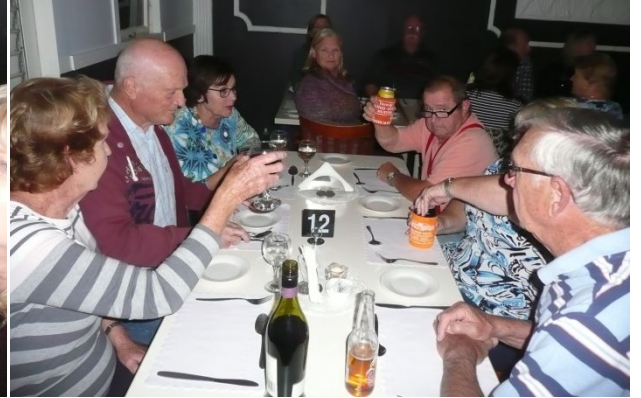
Is his mouth big enough?