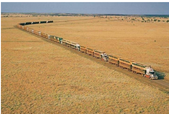
How about meeting one of these convoys on your travels

contents of this document are intended for the original club recipients and must not be on forwarded without the permission of the Author. None of the contents of this newsletter necessarily states the views of the Peninsula Caravan Club Inc or that of the editor unless otherwise stated.