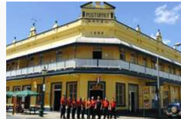
Post Office Hotel

Maryborough is a city located on the Mary River in South East Queensland, Australia, approximately 255 kilometres (160 mi) north of the state capital, Brisbane. The city is serviced by the Bruce Highway , and has a population of approximately 22,000 (2004). It is closely tied to its neighbour city Hervey Bay which is approximately 30 kilometres (20 mi) north-east. Together they form part of the area known as the Fraser Coast.