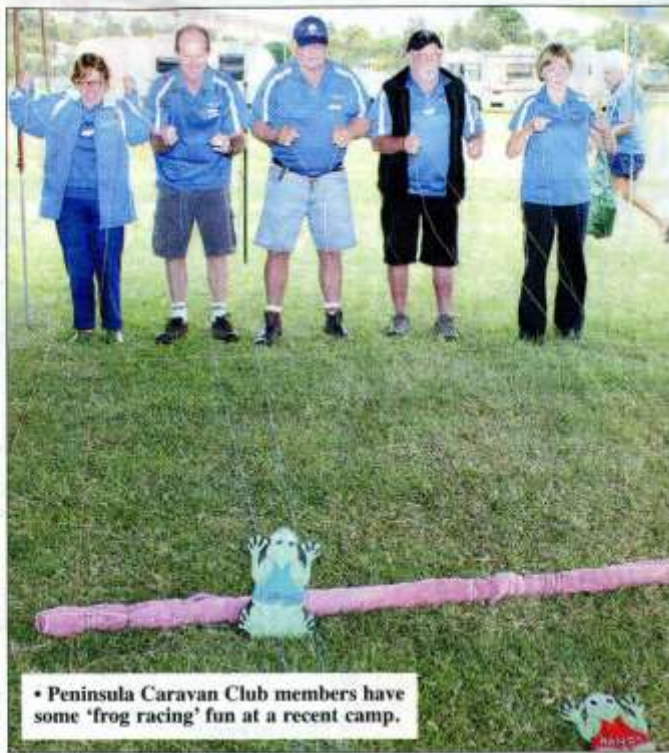
• Peninsula Caravan Club members have some 'frog racing' fun at a recent camp.