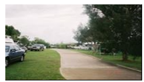
Next Month's Rally