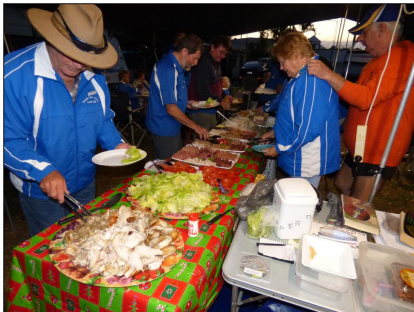
A Lovely meal from our Committee was enjoyed by all.