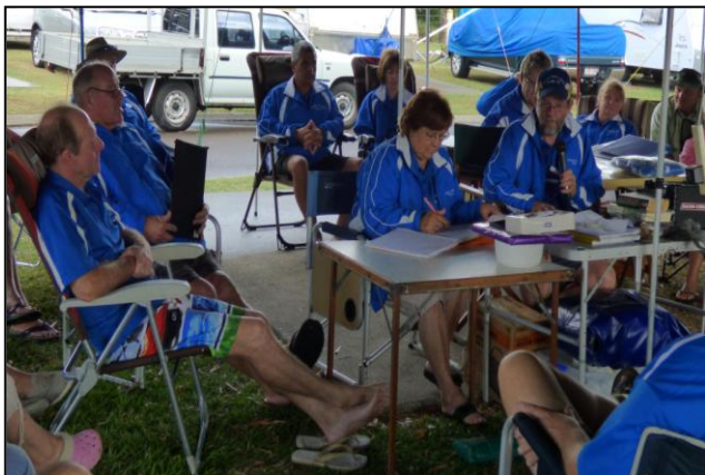
Committee hard at work running the AGM.