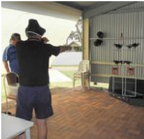
Stoning the Crows in the Pirates Nest