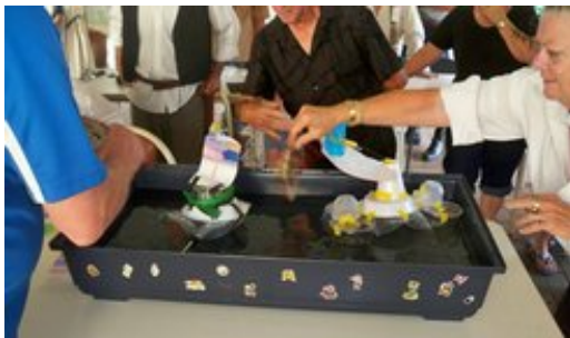
Pirate ships on the High Seas