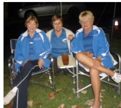
The Girls really can SMILE!!!