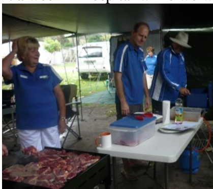
BBQ Lunch on Saturday

I spent a week in hospital while we were at Mildura with chest pains, all is OK