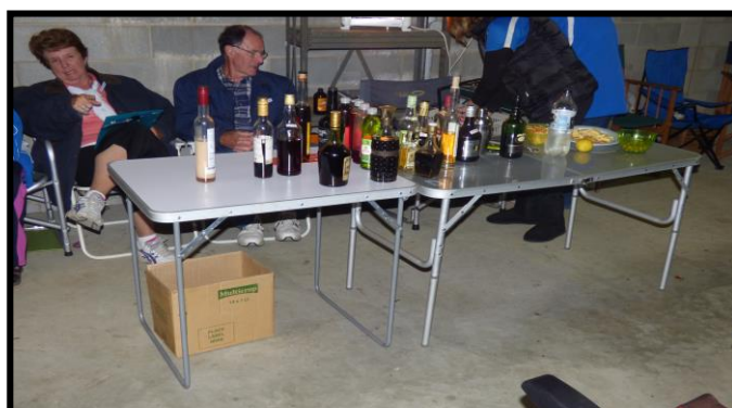
'Open Bar' on Saturday Night