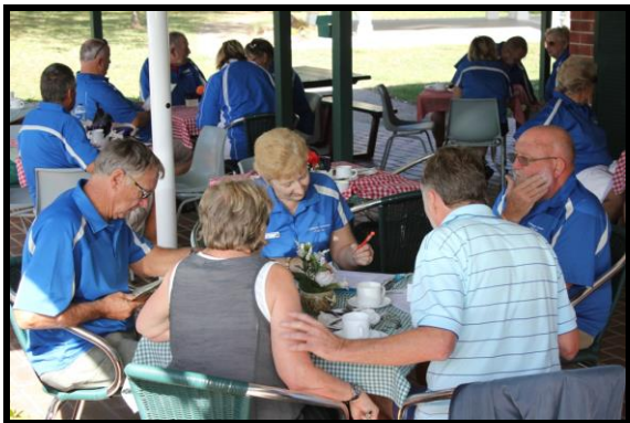
Already hard at work ... We aim to win!!!!