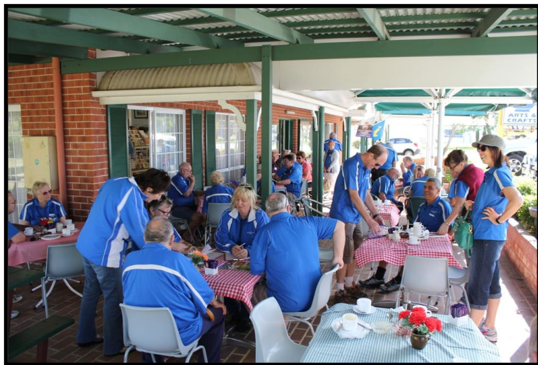
Devonshire Tea at the Arts & Craft Centre