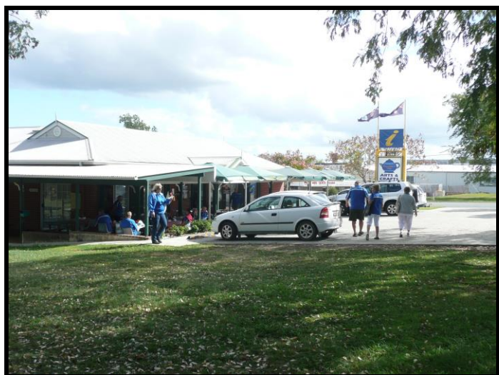
Getting started on the Frustrating Fact Finder Mission