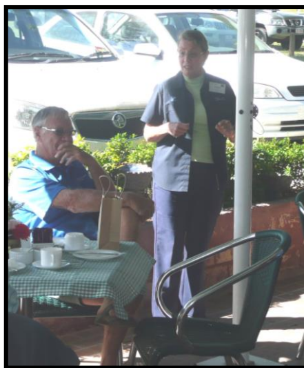
The Bush Poet