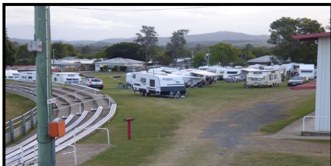
A Good Turn-up at the Showgrounds