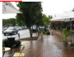
Pomona – Main Street

Pomona is nestled at the foot of Mount Cooroora; Pomona is a relaxed country town with some pleasant easy walking tracks around delightful parks. Pomona was first settled in the late 1880s and the railway that arrived in 1891 started the expansion of the agricultural industries. Originally known as Pinbarren Siding, the name was changed in 1906 to Pomona. From 1909 until 1980 Pomona was the administrative centre for the former Noosa Shire Council. Pomona is also the home of the Majestic Cinema, the oldest continuously running silent movie cinema in the world, 'Talkies' were introduced briefly in 1931, but the cinema reverted back to silent movies and today shows The Son of the Sheik, starring Rudolf Valentino, every Thursday. Pomona is located about 25 minutes from Noosa, just beyond Cooroy and you can drive to the towns of Cooran, Kin Kin and Boreen Point, also you can do the Pomona Heritage walk & Cooroora Creek walk.