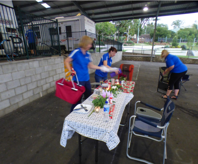
Nothing posh about our club—but a touch of class never goes astray—even at a sausage sizzle. Well done guys, love your work.