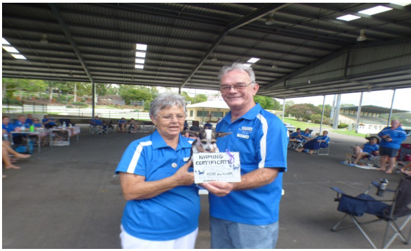
ABBY alias "KILLER" NAMING