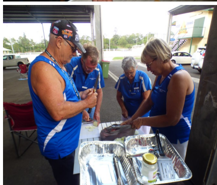
Onion peelers—Thanks everyone.