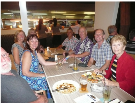
Friday night dinner at Nambour RSL