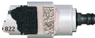
B.E.S.T. Inline Cutaway shown above