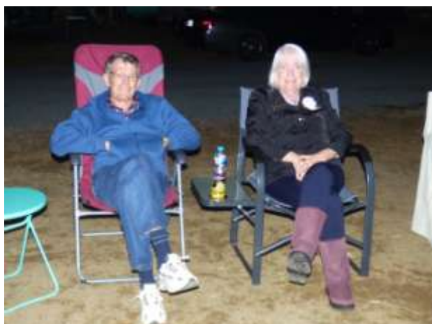
Those infamous wine bottle storers

Sunday morning, the sun was shining and several more expeditions headed out to discover the delights of the Nanango area as many members packed to go home.