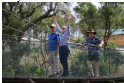
Cooyar swinging bridge

Saturday morning saw several expeditions heading out, visiting the swinging bridge at Cooyar, scenic walk through the Palms, just out of Cooyar, the Lavender Farm on the way to Kingaroy and the local shops. It was observed that some of the members were reverting to their childhood by playing on playground equipment at Cooyar.