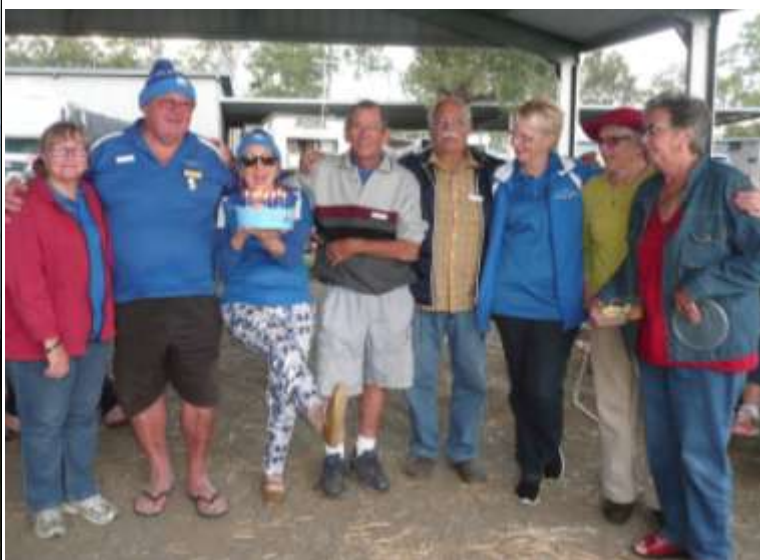
June is a big birthday month!