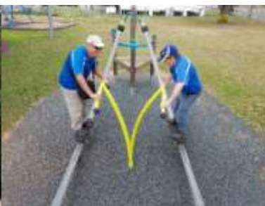
Children at play

On Saturday night a plague of locusts descended upon the Soup Kitchen devouring all before them. When it came to the vote, the chicken and vegetable soup was the most popular. It should also be noted that the club members have perfected the art of damper making although there is contention that an electric bread maker counts as a camp oven.