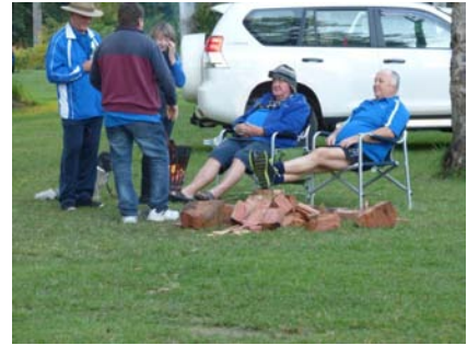
What a life