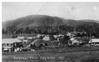
Dayboro in 1917

Next Month's Rally – Dayboro Show Grounds Mt. Mee Road, Dayboro 4521 Ph: 07 3425 1137 Wednesday 15 th – Monday 20 th July