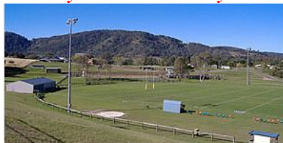
Dayboro Show Grounds