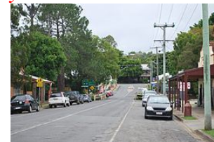
Main Street of Dayboro