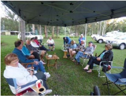
Happy hour under the new gazebo