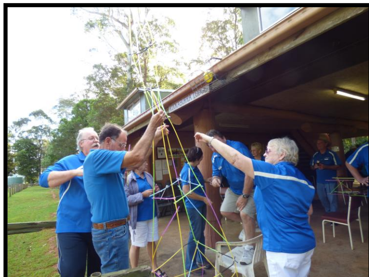
The Falling Tower