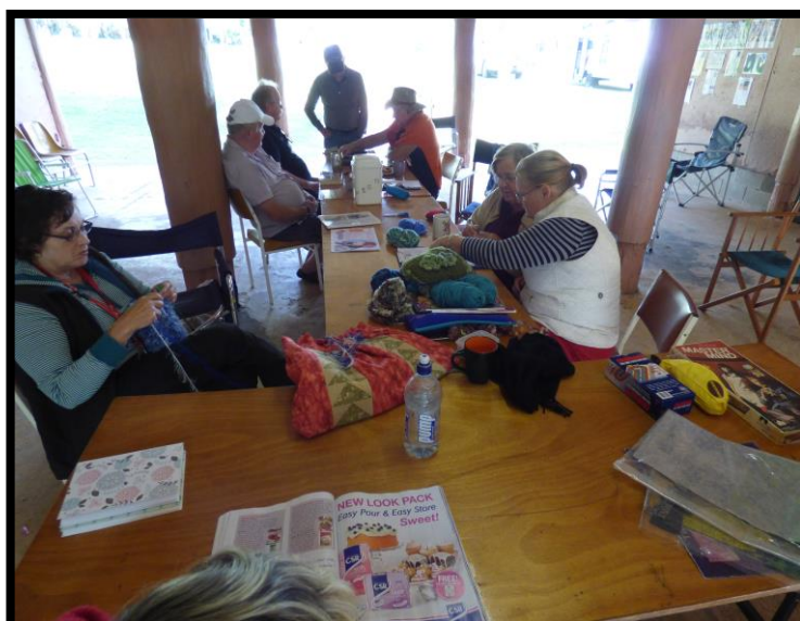
The Girls at Craft