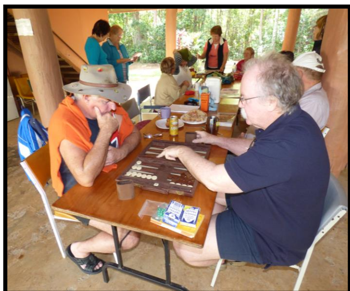
Guys at Backgammon

Sunday morning we had our first Ladies 'Craft Morning' and 'Board Games for the Men