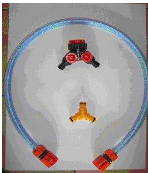
This is the 'Y' hose Connection to be used