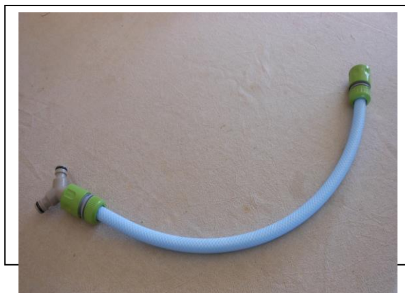
Photo from Eric's email Please see page 8 for Hose Connection to be used