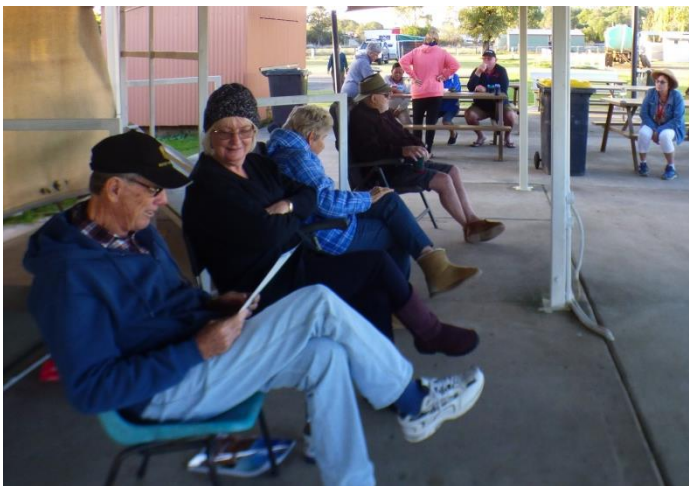
Waiting to begin Happy Hour Thursday