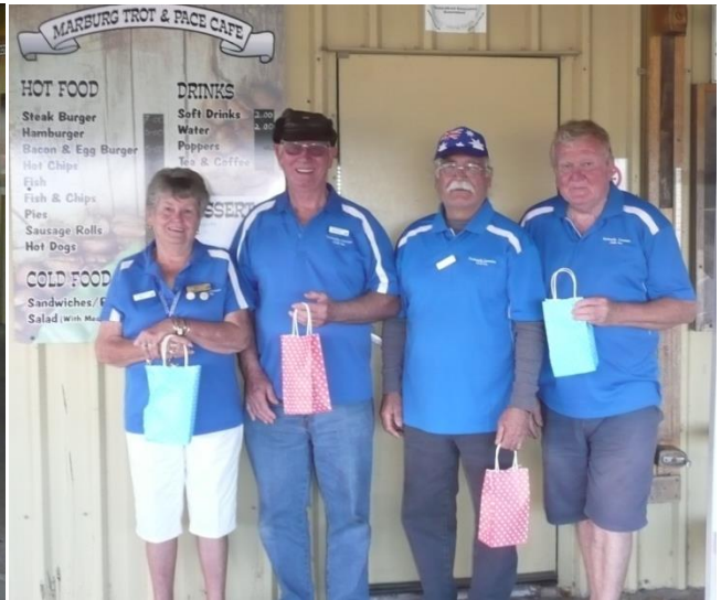
"Now, all you have to do is get the ball into the bowl". And the winners are....