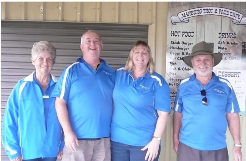
Thanks to our hard working activity organisers