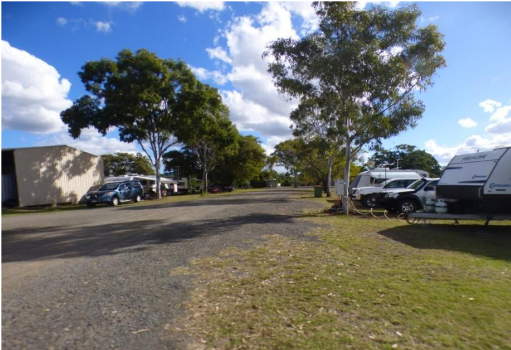
Marburg Showground - quiet and peaceful