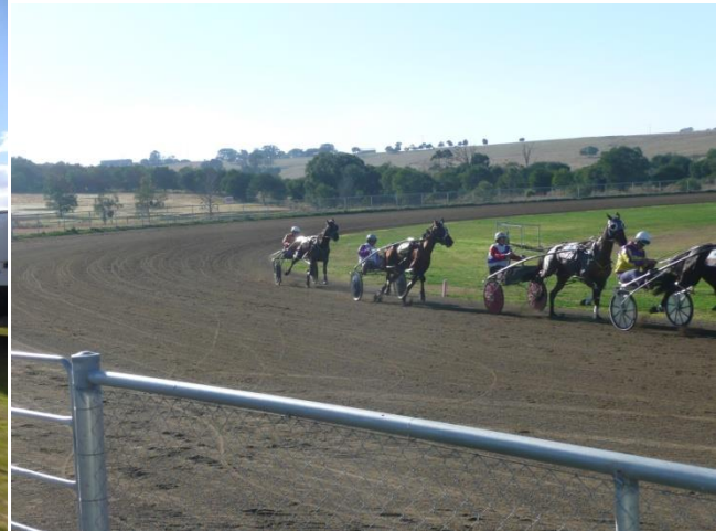
The Paceway provided a distraction