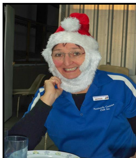
Our 'Hat Queen' in Santa mode