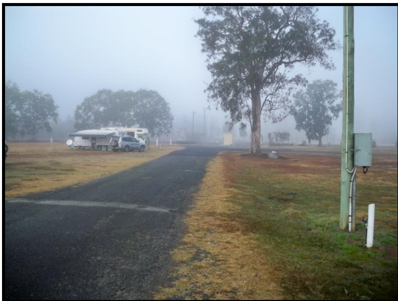
A very thick fog – Photo taken around 8 am Friday

PLEASE ADVISE EDITOR OF ACTIVITY AND REQUIREMENTS IF ANY (eg. dress-ups/food/etc) THAT YOU WISH TO GO IN THIS SPACE ----- Thank you.