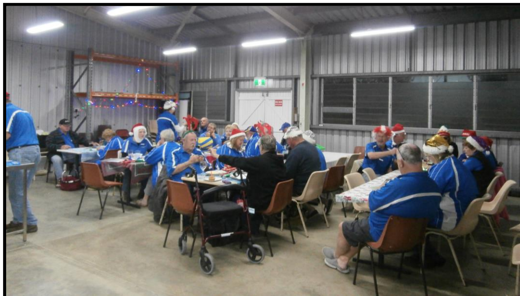
The shed was large and here we are doing our Christmas games.