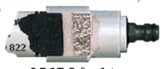
B.E.S.T. Inline Cutaway shown above