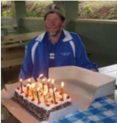
Les 60<sup>th</sup> Birthday Cake