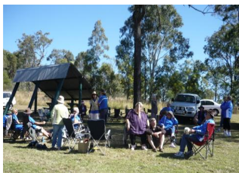
Morning Tea at the Look Out