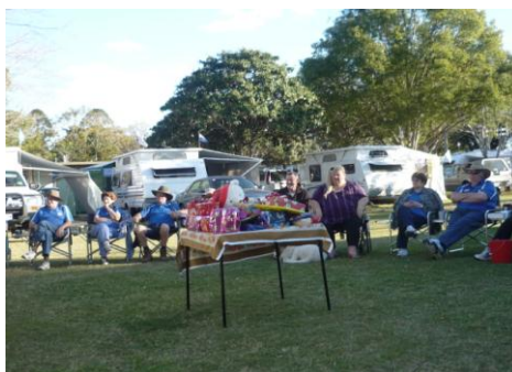
Secret Santa - with a twist