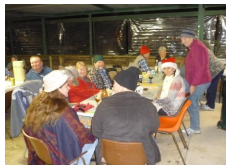
Meal - Xmas in July