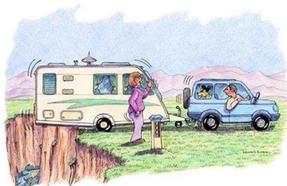
"Keep going, you're well clear of the bollard."