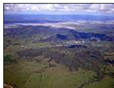
Over-looking Wivenhoe Dam