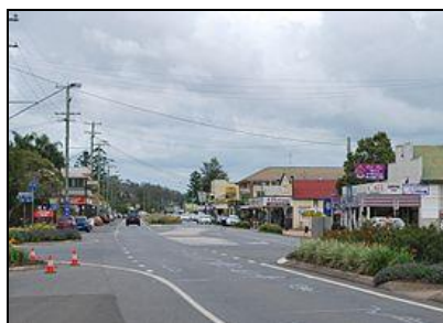
Township of Esk

Next Month's Rally –Esk Caravan Park 26 HASSALL STREET. ESK 4312 07- 5424 1466 Wednesday 12 th - Monday 17 th February