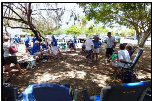
Relaxing & chatting under the trees.

A lovely day was had by all..... See you at Esk next month for our first rally of 2014. Lyle