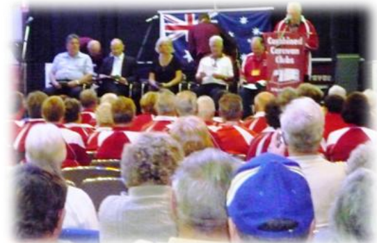
September-Toogoolawah State Rally