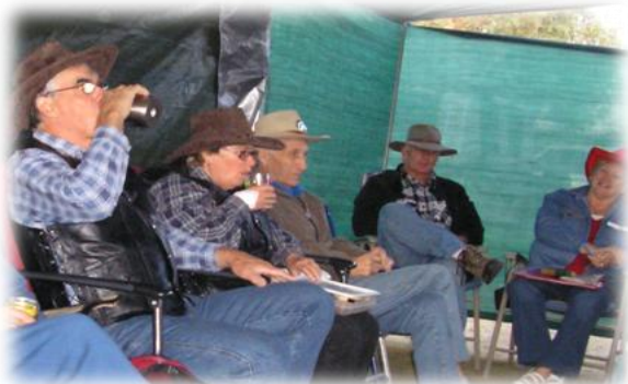
Lake Dyer-Country Western Night