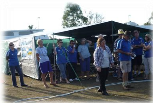
May- Lake Dyer-Horse shoes Comp