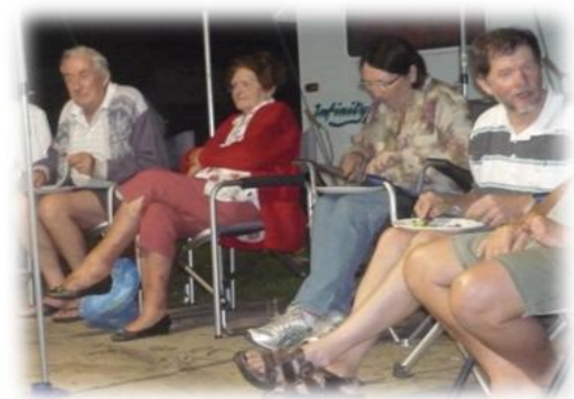
November-Dicky Beach, BBQpm