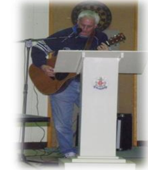
Macca & his guitar