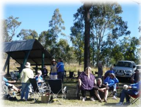
July- Esk -Look Out/Morning Tea