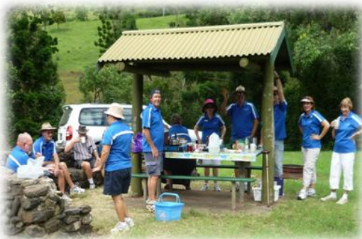
March-Lions Road- Morning Tea