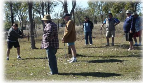
PCCI Hackers golf morning