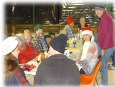
Xmas in July Dinner