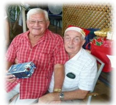
Xmas Lunch- Santa