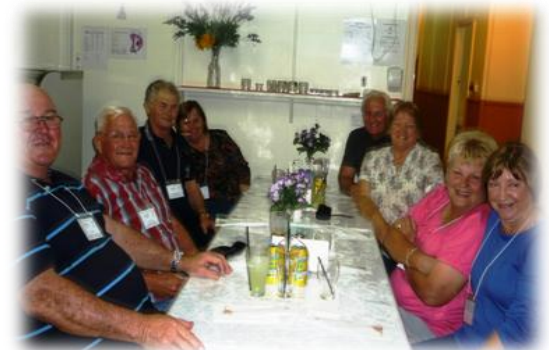
Dinner at Hotel