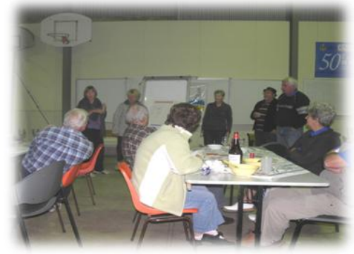
Spicks & Specks Trivia