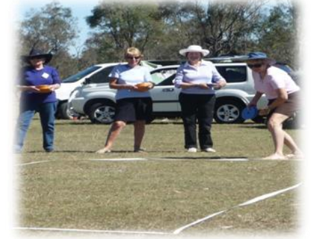
Disc Bowls – ladies