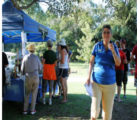
Neurum Creek May 2009 – Wine Tasting