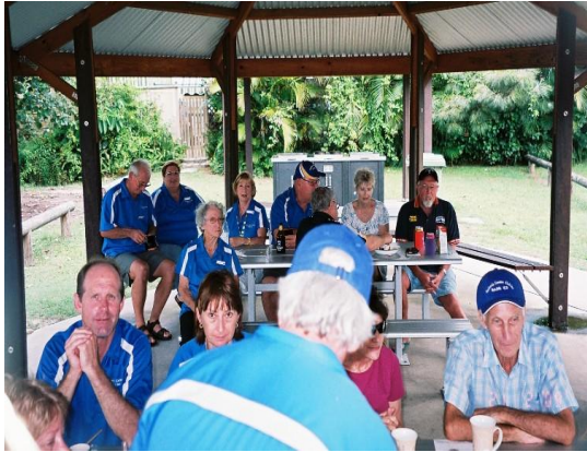
Cotton Tree C/Pk Feb.2009- Club Meeting