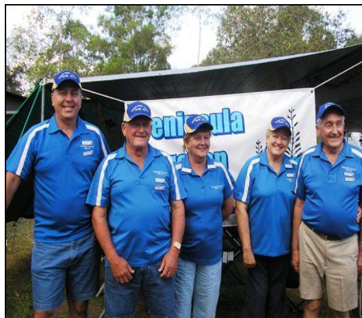
PCCI Committee for 2009-2010