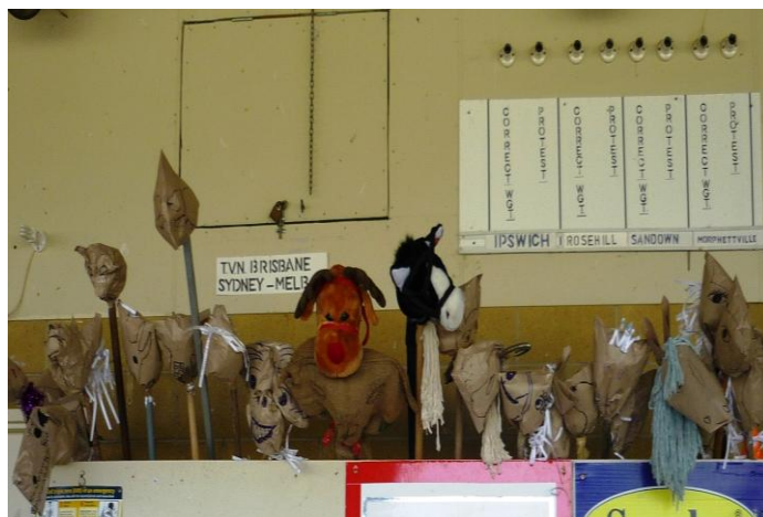
Kilcoy s/grounds Nov.2009 – The Mounting Yard