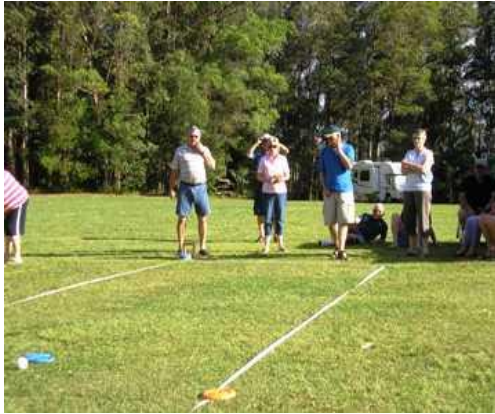
Lake Macdonald Oct.2008- First Disc Bowls