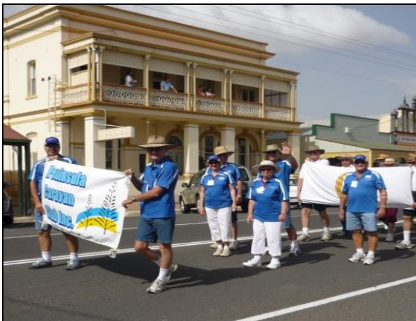
Pittsworth State Rally 2009