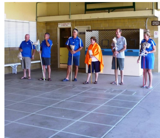
Kilcoy s/grounds Nov.2009 – The Peninsula Cup