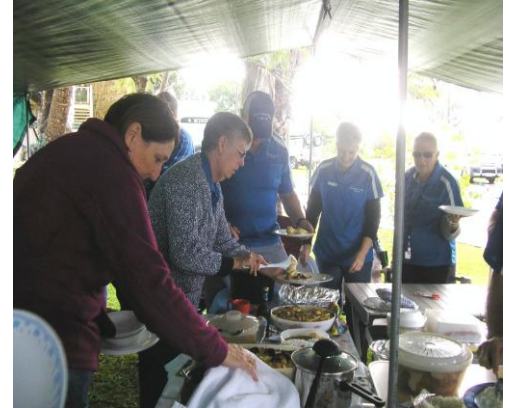
Murwillumbah Jun.2009 –Casserole Lunch