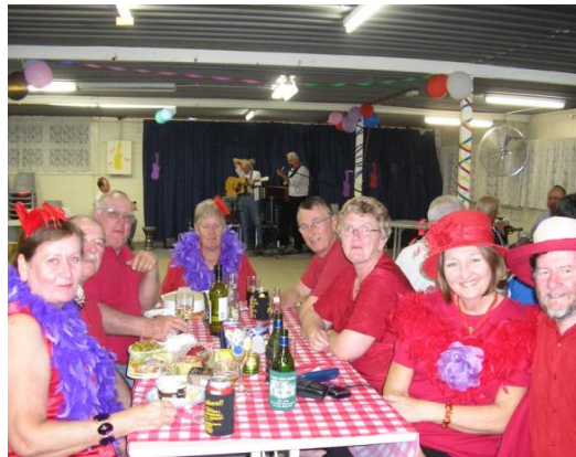
Boonah Aug.2009 – A Hot August Night