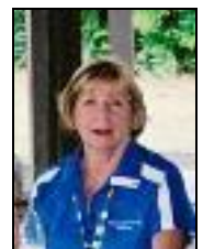
Editor - Newsletter