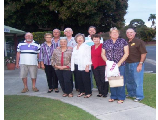
Boyds Bay Sept.2009 – Seafood Night