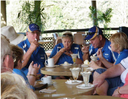
Nambour Apr.2009 – Icecream @ Big Pineapple