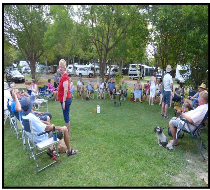
'HAPPY HOUR' under the shady trees On Valentine's Day