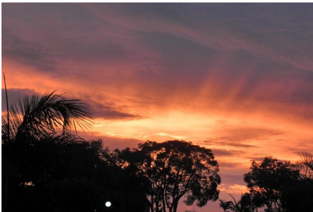
After all that rain ... what a beautiful photo!