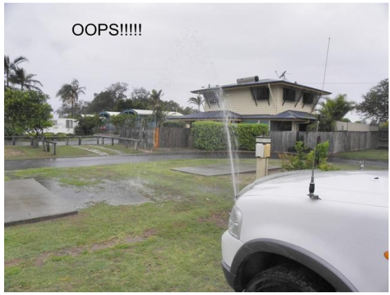
OOPS alright! I wonder who's car that is?