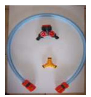
Piggy back connection

1 Thetford 145 - Portable Toilet. One canister is 12lts, the second canister is 15lts. As new, used only on two rallies. New $175.00 will sell for $100.00 - 1 green ensuite (pop up type) used twice also. $15.00. Contact Vicki Mackenzie Phone 3204 0705 or email v_mac52@hotmail.com