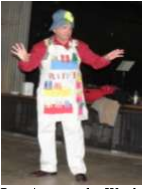
Pegging out the Wash