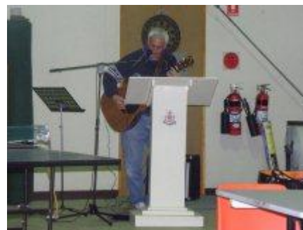
Macca at the pulpit