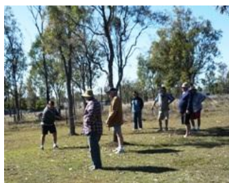
Golf Hackers Club-