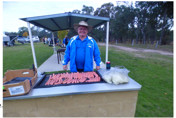
No problem getting helpers to cook our barbies. Thanks everyone.