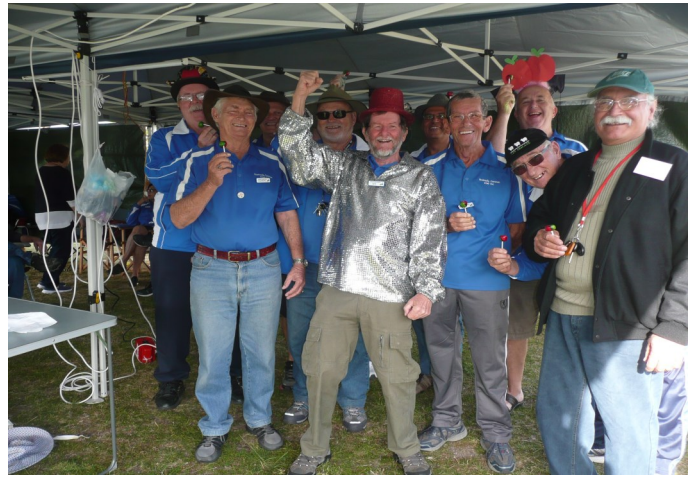
The winning team... or was that the cheating team. hahaha