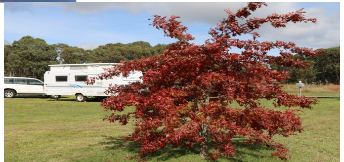
These trees added so much colour everywhere you went.