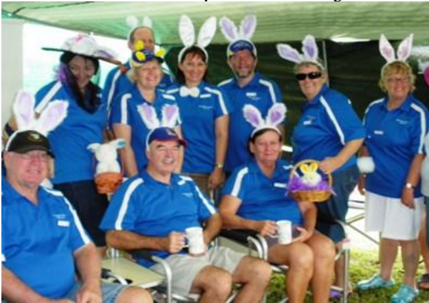
Easter Hat/Bunny ears Parade