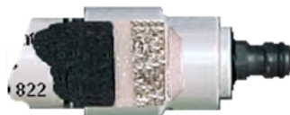
B.E.S.T. Inline Cutaway shown above