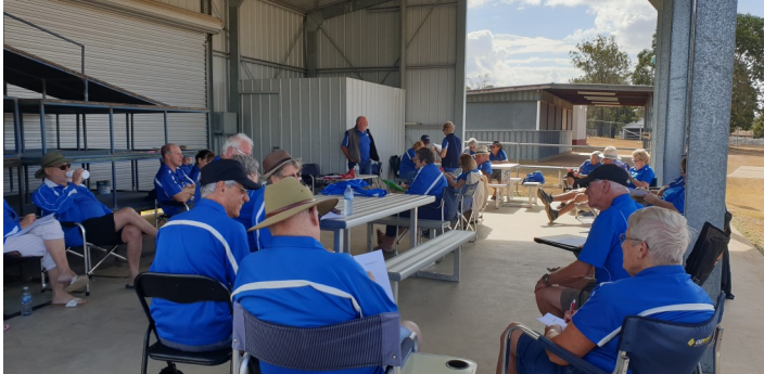
With position comes power