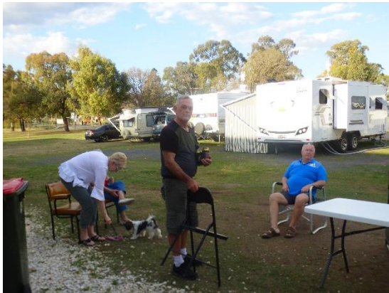
Friday Happy Hour