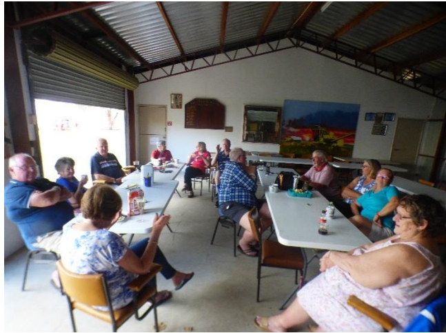
Thursday Happy Hour