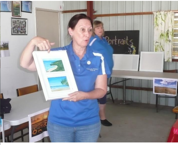
The finished postcards